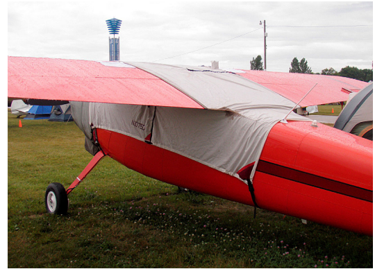
Over-Top Canopy Cover & Engine Cover