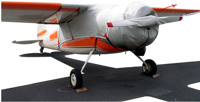
Cessna 195 Over-Top Canopy, Engine & Prop Covers

The material is very reflective, and tests show that the cabin interior temperature can be reduced to near-ambient temperature on the hottest of days. It is water, ice and snow repellent, yet breathable to allow moisture to escape from between the cover and the aircraft surface.