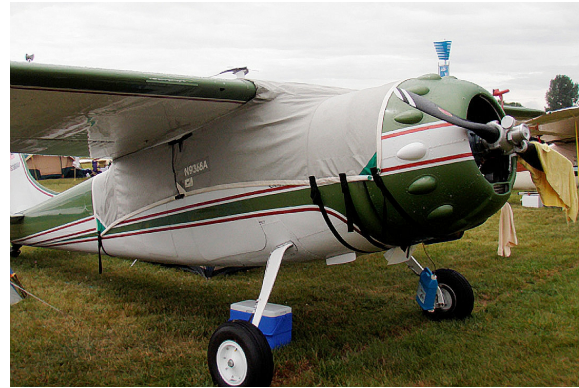
Cessna 195 Canopy Cover, extended forward and over gas caps