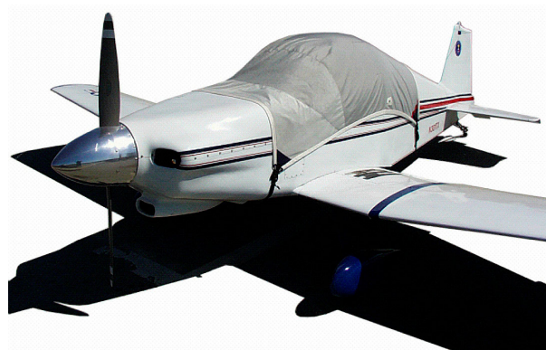
Standard Canopy Cover for Thorp T-18