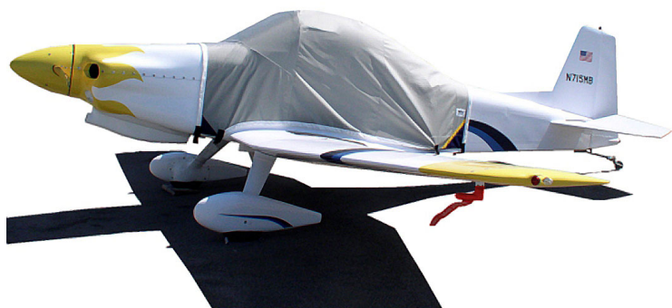
Bushby Mustang Extended Canopy Cover

This cover type is made from Silver Acrylic Sunbrella canvas and is 100% lined with a soft and smooth microfiber. Bruce's Custom Covers developed this material combination especially for aircraft protection. The outer material is medium weight and treated for water resistance, UV resistance and anti-static buildup. The inner lining is a very soft and smooth microfiber to prevent scratching. The material is very reflective, and tests show that the cabin interior temperature can be reduced to near-ambient temperature on the hottest of days. It is water, ice and snow repellent, yet breathable to allow moisture to escape from between the cover and the aircraft surface.