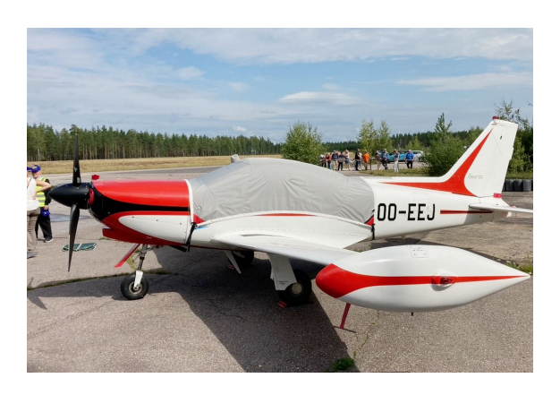
Siai Marchetti SF260 Light Weight Travel Canopy Cover