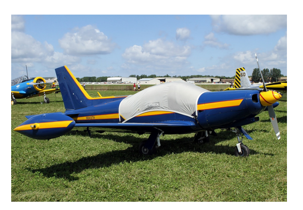
Siai Marchetti SF260 Canopy Cover