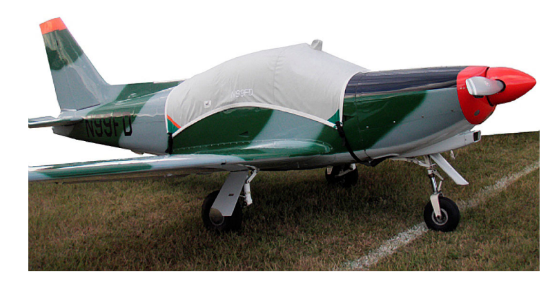
Standard Canopy Cover

This cover type is made from Silver Acrylic Sunbrella canvas and is 100% lined with a soft and smooth microfiber. Bruce's Custom Covers developed this material combination especially for aircraft protection. The outer material is medium weight and treated for water resistance, UV resistance and anti-static buildup. The inner lining is a very soft and smooth microfiber to prevent scratching. The material is very reflective, and tests show that the cabin interior temperature can be reduced to near-ambient temperature on the hottest of days. It is water, ice and snow repellent, yet breathable to allow moisture to escape from between the cover and the aircraft surface.