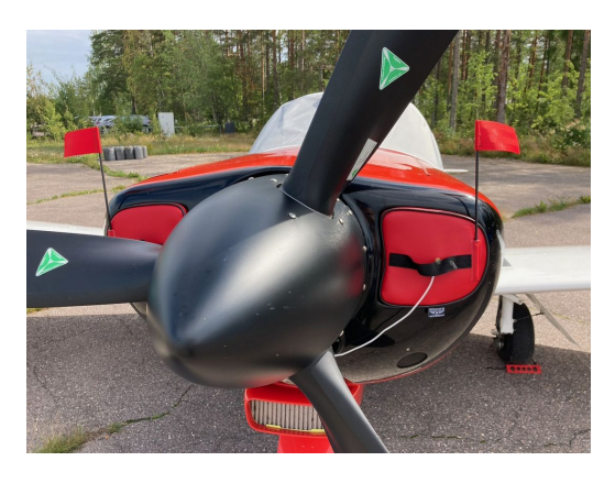
Siai Marchetti SF260 Engine Plugs

Engine Inlet Plugs are custom fit for your Siai Marchetti SF260 intakes, made with heavy-duty vinyl material, and stuffed with a single block of sculpted urethane foam. Each plug has a zipper that allows the foam to be removed and dried if necessary. Engine plugs have warning flags that are visible from the cockpit or 'remove before flight' streamers sewn onto the face of the plugs. Most plugs are imprinted with the aircraft registration number in black for an extra charge. Storage bag NOT included. Engine plugs may be inserted after flight when the engine is still warm. Engine Inlet Plugs are commonly referred to as Cowl Plugs, Intake Plugs, Cowl Blocks, Engine Blocks, and Engine Bungs.