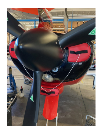
Siai Marchetti SF260 Engine Plugs