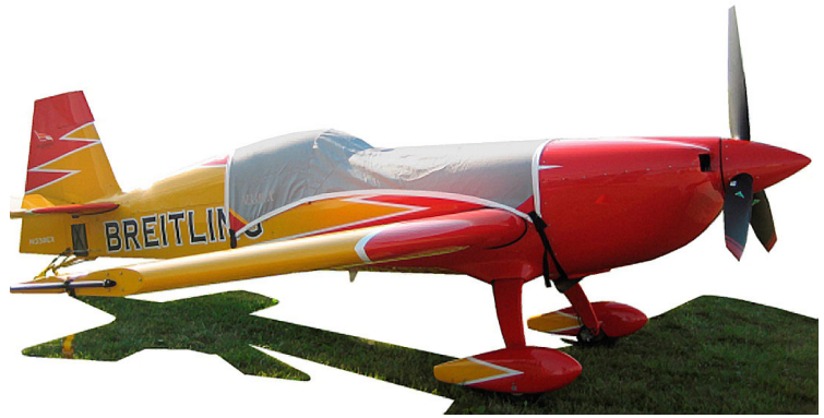
Extra 300sc Canopy Cover