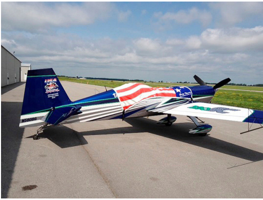
Extra 300SC Canopy Cover with custom artwork