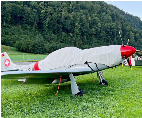
Stewart S-51 Canopy & Engine Covers