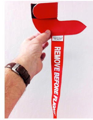
Standard Pitot Cover