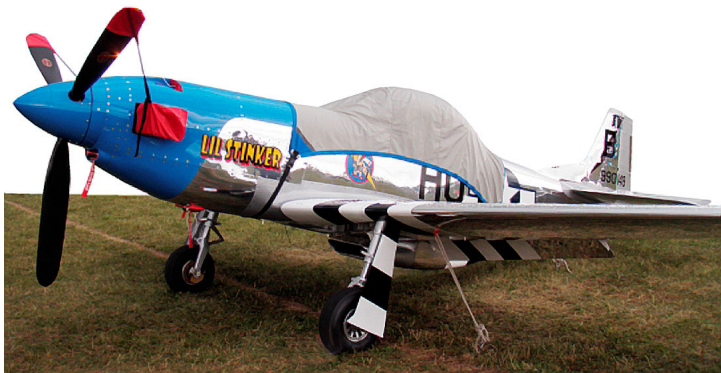
Stewart Mustang Canopy Cover, Prop Tie Downs & Intake Plugs

Covers developed this material combination especially for aircraft protection. The outer material is medium weight and treated for water resistance, UV resistance and anti-static buildup. The inner lining is a very soft and smooth microfiber to prevent scratching. The material is very reflective, and tests show that the cabin interior temperature can be reduced to near-ambient temperature on the hottest of days. It is water, ice and snow repellent, yet breathable to allow moisture to escape from between the cover and the aircraft surface.