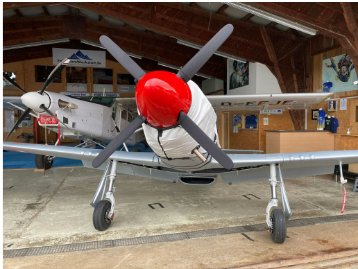
SW-51 Mustang Engine Cover

This cover type is made from Silver Acrylic Sunbrella canvas and is 100% lined with a soft and smooth microfiber. Bruce's Custom Covers developed this material combination especially for aircraft protection. The outer material is medium weight and treated for water resistance, UV resistance and anti-static buildup. The inner lining is a very soft and smooth microfiber to prevent scratching. The material is very reflective, and tests show that the cabin interior temperature can be reduced to near-ambient temperature on the hottest of days. It is water, ice and snow repellent, yet breathable to allow moisture to escape from between the cover and the aircraft surface.