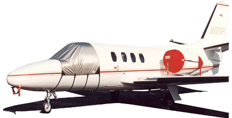
Cessna Citation I Windshield, Pitot and Engine Covers