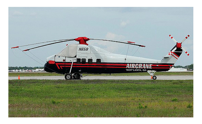
S58 Cockpit Windshield, Main Rotor, Particle Separator, Exhaust Covers, Intake Plugs and Blade Tie-downs