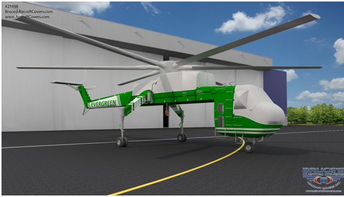
Sikorsky S-64 Canopy/Nose, Engine Area, Blade, Rotor, Tail Rotor Sikorsky S-64 Skycrane, CH-54 Tarhe Insulated Engine, Rotor Hub, Tailboom, Stabilizer & Tail Rotor Covers (illustration)