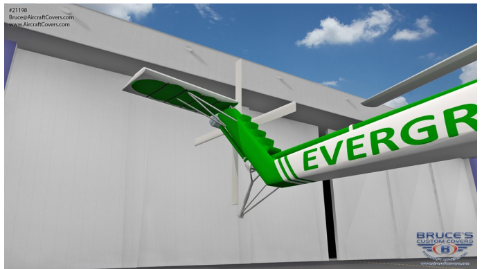
Sikorsky S-64 Skycrane, CH-54 Tarhe Insulated Engine, Rotor Sikorsky S-64 Canopy/Nose, Engine Area, Blade, Rotor, Tail Rotor Hub, Tailboom, Stabilizer & Tail Rotor Covers (illustration)