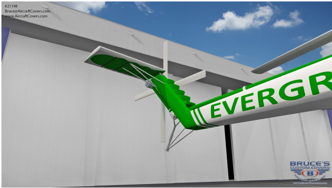
Sikorsky S-64 Skycrane, CH-54 Tarhe Insulated Engine, Rotor Sikorsky S-64 Canopy/Nose, Engine Area, Blade, Rotor, Tail Rotor Hub, Tailboom, Stabilizer & Tail Rotor Covers (illustration)