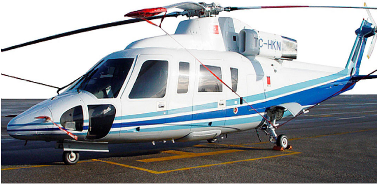
S76 Blade Tie-Downs and Pitot Cover set

WINTER USE MATERIAL - Made with Solution-Dyed Polyester fabric, this option is intended for seasonal use to aid in deicing, rain mitigation, or for occasional travel. The material is lighter and more compact, but more susceptible to UV damage and may have a shorter useful life if used continuously outside than the all-year use material.