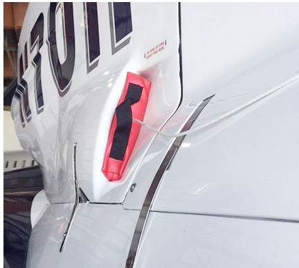
Sikorsky S76 (All Models) Intake Plugs (S76c Models)

The Engine Inlet Plugs are custom fit for your Sikorsky S76 (All Models) intakes, made with heavy-duty vinyl material, and stuffed with a single block of sculpted urethane foam. Each plug has a zipper that allows the foam to be removed and dried if necessary. Engine plugs have 'Remove Before Flight' streamers sewn onto the face of the plugs. Most plugs are imprinted with the aircraft registration number in black for an extra charge. Storage bag NOT included. Engine plugs may be inserted after flight when the engine is still warm. Engine Inlet Plugs are commonly referred to as Cowl Plugs, Intake Plugs, Cowl Blocks, Engine Blocks, and Engine Bungs.