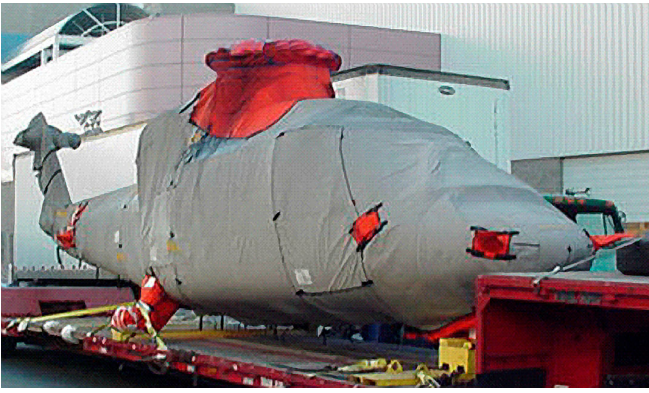
S76 Full Body Transport Cover