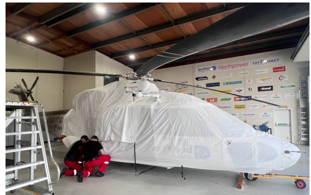
Sikorsky S76C Forward Canopy Cover, Engine Cover (test fit covers)