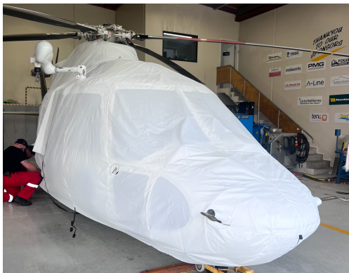
Sikorsky S76C Forward Canopy Cover, Engine Cover (test fit covers)

Travel Covers are made with Silver Solution-Dyed Polyester fabric and fully lined over the entire cover. The material is lightweight and more compact for easy storage in the aircraft. The polyester material is water resistant, but only intended for occasional use outside. We also have an ultra lightweight material available for fitted hangar dust covers. For daily outdoor use, the non-travel Sunbrella Cover is the best choice.