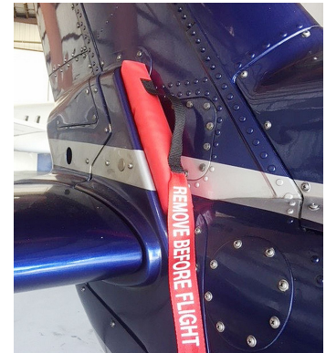
S76 Tail Wedge Plug