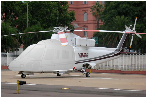
Sikorsky S76 Bubble Cover (Forward Canopy Cover)