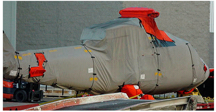
S76 Full Body Transport Cover