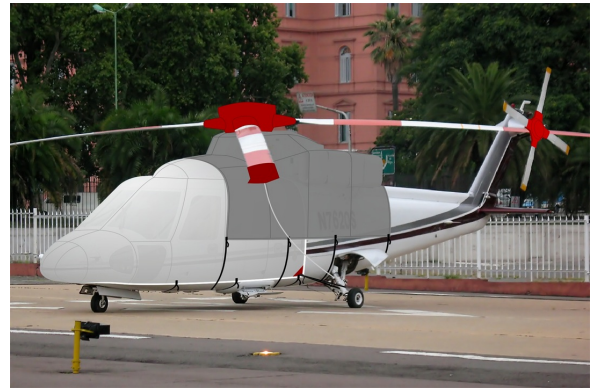
S76 Forward Fuselage, Engine, Main & Tail Rotor Hub Covers (illustration)