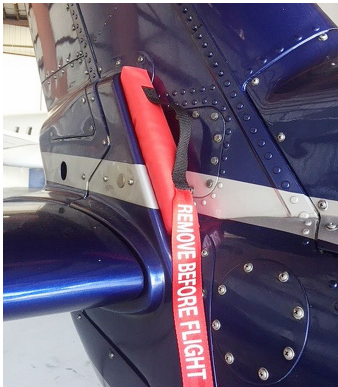
S76 Tail Wedge Plug

The Engine Inlet Plugs are custom fit for your Sikorsky S76 (All Models) intakes, made with heavy-duty vinyl material, and stuffed with a single block of sculpted urethane foam. Each plug has a zipper that allows the foam to be removed and dried if necessary. Engine plugs have 'Remove Before Flight' streamers sewn onto the face of the plugs. Most plugs are imprinted with the aircraft registration number in black for an extra charge. Storage bag NOT included. Engine plugs may be inserted after flight when the engine is still warm. Engine Inlet Plugs are commonly referred to as Cowl Plugs, Intake Plugs, Cowl Blocks, Engine Blocks, and Engine Bungs.