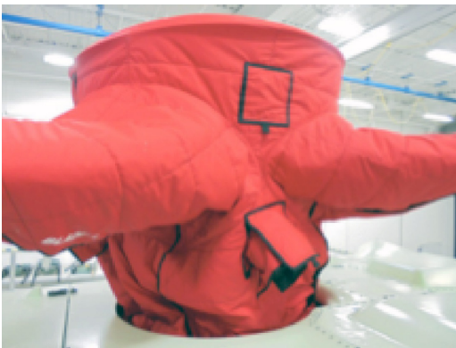
Sikorsky S-92 Main Rotor Mast Cover, Insulated, w/Heater Hose Inlets