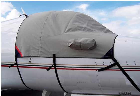
Sabre Cockpit Cover