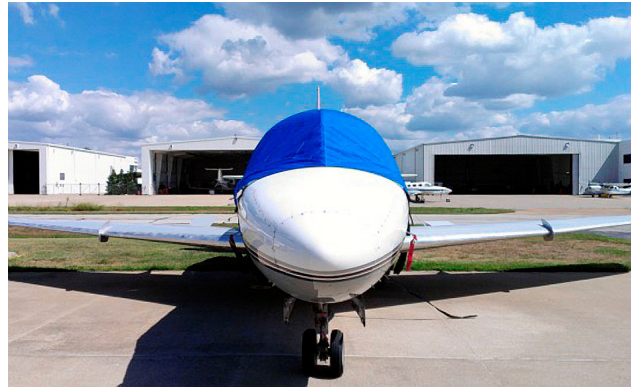
Rockwell Sabre Cockpit/Door Cover