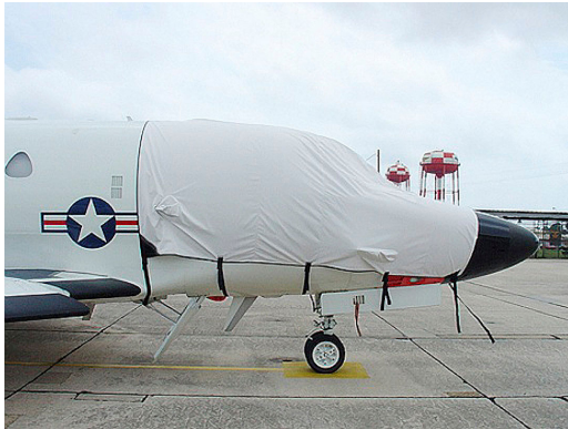
Sabre 40 Cockpit Cover

This cover type is made from Silver Acrylic Sunbrella canvas and is 100% lined with a soft and smooth microfiber. Bruce's Custom Covers developed this material combination especially for aircraft protection. The outer material is medium weight and treated for water resistance, UV resistance and anti-static buildup. The inner lining is a very soft and smooth microfiber to prevent scratching. The material is very reflective, and tests show that the cabin interior temperature can be reduced to near-ambient temperature on the hottest of days. It is water, ice and snow repellent, yet breathable to allow moisture to escape from between the cover and the aircraft surface.