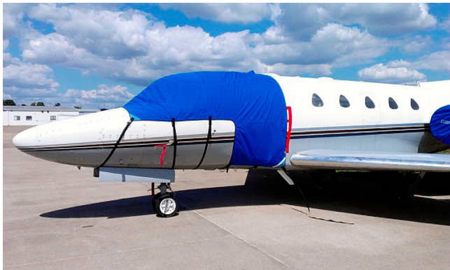
Rockwell Sabre Cockpit/Door Cover

This cover type is made from Silver Acrylic Sunbrella canvas and is 100% lined with a soft and smooth microfiber. Bruce's Custom Covers developed this material combination especially for aircraft protection. The outer material is medium weight and treated for water resistance, UV resistance and anti-static buildup. The inner lining is a very soft and smooth microfiber to prevent scratching. The material is very reflective, and tests show that the cabin interior temperature can be reduced to near-ambient temperature on the hottest of days. It is water, ice and snow repellent, yet breathable to allow moisture to escape from between the cover and the aircraft surface.