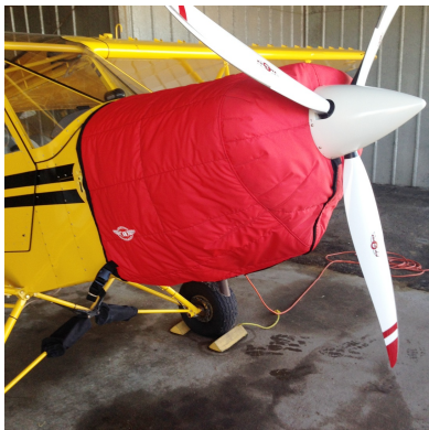
Zlin Savage Insulated Engine Cover