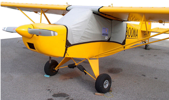
Zlin Savage Canopy Cover