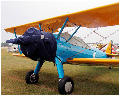
Stearman Canopy, Engine & Prop Covers