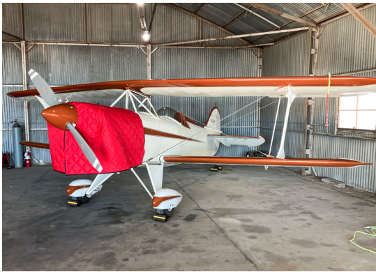
SKYBOLT, Insulated Hangar Blanket, Custom Fit Interior Use)