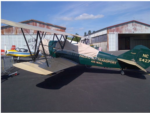
Travelair 4000 Canopy and Engine Cover

the hottest of days. It is water, ice and snow repellent, yet breathable to allow moisture to escape from between the cover and the aircraft surface.