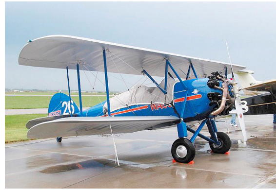
Waco ASO Canopy Cover