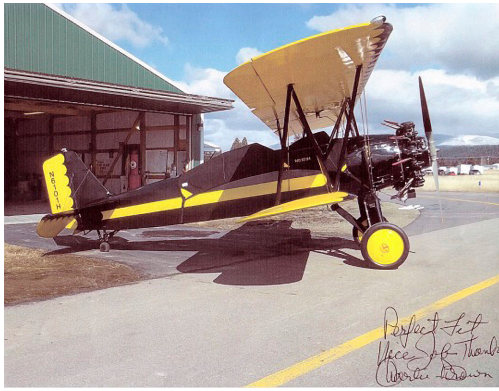
Stearman C3 Canopy Cover