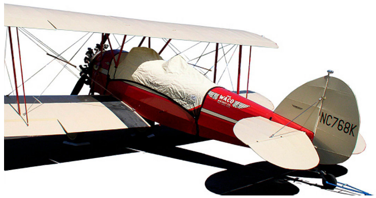
Waco 10 Canopy Cover