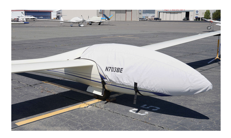
Schempp-Hirth Ventus C Canopy/Nose Cover