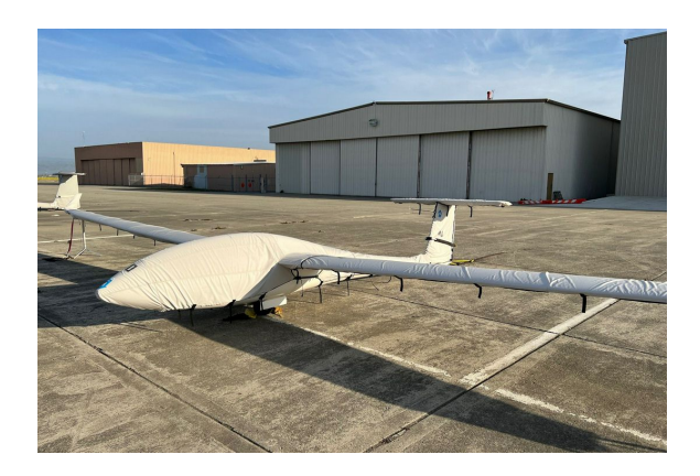
Schempp-Hirth Discus 2B Complete Cover Set