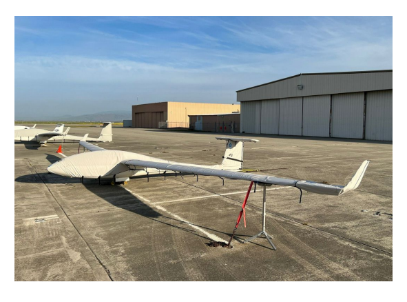
Schempp-Hirth Discus 2B Complete Cover Set