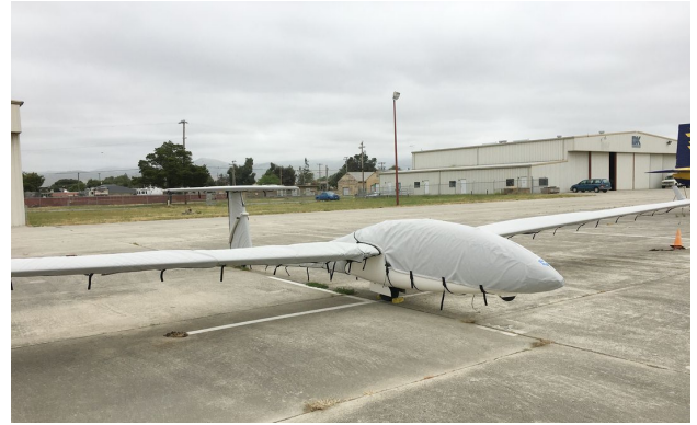
DG-505 Canopy/Nose, Wing, Empennage & Horiz. Stab. Covers