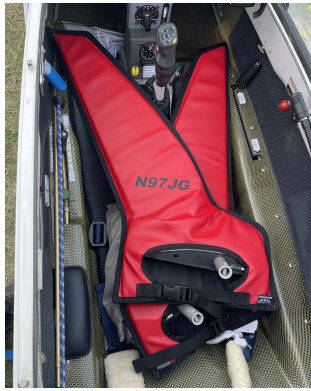
Schempp-Hirth Ventus-2B winglet/wingtip pads