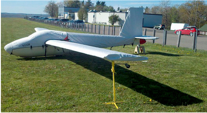
SGS 1-26B Canopy/Nose, Empennage & Wing Covers