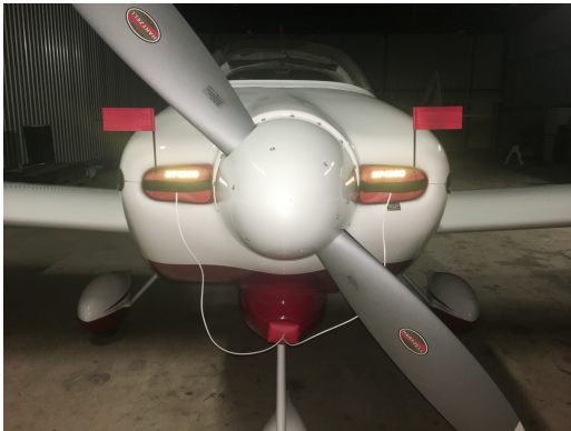
Van's Aircraft RV-7A Engine Inlet Plugs

Engine Inlet Plugs are custom fit for your Tomark Aero Viper SD4 intakes, made with heavy-duty vinyl material, and stuffed with a single block of sculpted urethane foam. Each plug has a zipper that allows the foam to be removed and dried if necessary. Engine plugs have warning flags that are visible from the cockpit or 'remove before flight' streamers sewn onto the face of the plugs. Most plugs are imprinted with the aircraft registration number in black for an extra charge. Storage bag NOT included. Engine plugs may be inserted after flight when the engine is still warm. Engine Inlet Plugs are commonly referred to as Cowl Plugs, Intake Plugs, Cowl Blocks, Engine Blocks, and Engine Bungs.