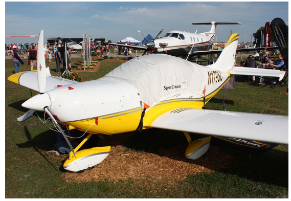
PiperSport Canopy Cover, Engine Plugs