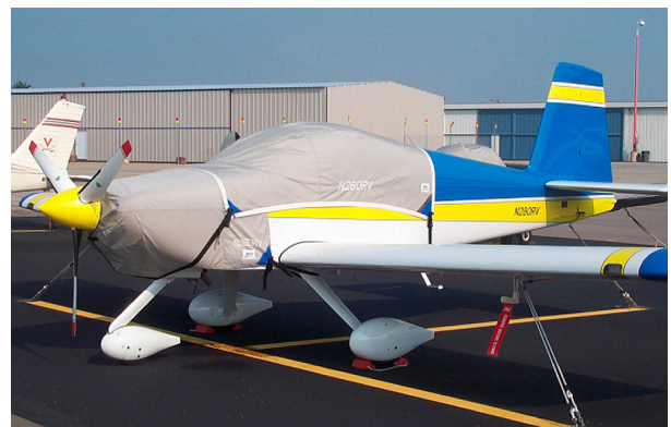
Van's RV-9 Canopy & Engine Covers