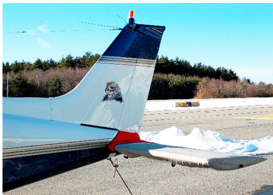
Tailcone & Horizontal Stabilizer Covers