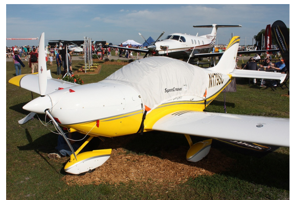
PiperSport Canopy Cover, Engine Plugs