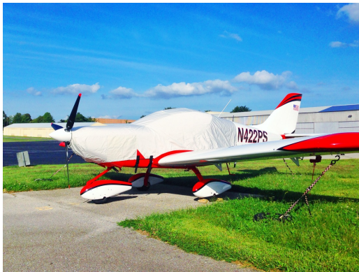
SportCruiser Canopy/Engine Cover