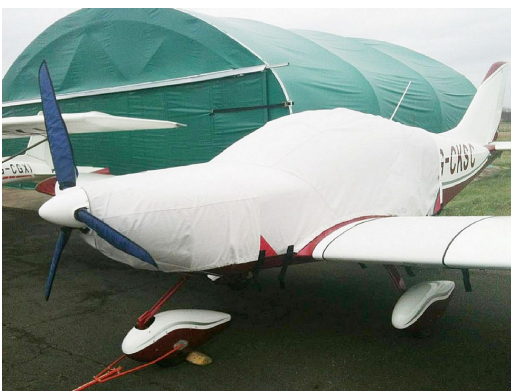
PiperSport Canopy/Engine Cover, Wing Locker Covers

This cover type is made from Silver Acrylic Sunbrella canvas and is 100% lined with a soft and smooth microfiber. Bruce's Custom Covers developed this material combination especially for aircraft protection. The outer material is medium weight and treated for water resistance, UV resistance and anti-static buildup. The inner lining is a very soft and smooth microfiber to prevent scratching. The material is very reflective, and tests show that the cabin interior temperature can be reduced to near-ambient temperature on the hottest of days. It is water, ice and snow repellent, yet breathable to allow moisture to escape from between the cover and the aircraft surface.