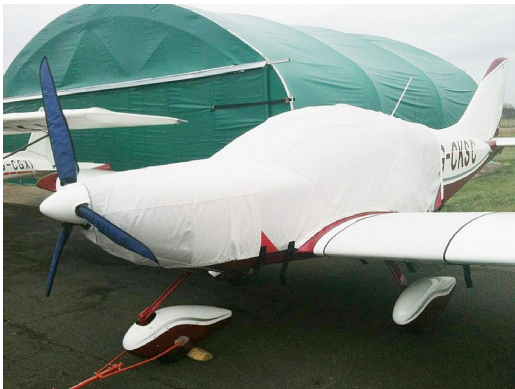
PiperSport Canopy/Engine Cover, Wing Locker Covers

This cover type is made from Silver Acrylic Sunbrella canvas and is 100% lined with a soft and smooth microfiber. Bruce's Custom Covers developed this material combination especially for aircraft protection. The outer material is medium weight and treated for water resistance, UV resistance and anti-static buildup. The inner lining is a very soft and smooth microfiber to prevent scratching. The material is very reflective, and tests show that the cabin interior temperature can be reduced to near-ambient temperature on the hottest of days. It is water, ice and snow repellent, yet breathable to allow moisture to escape from between the cover and the aircraft surface.