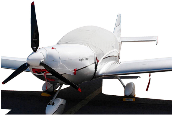
Sportcruiser Canopy Cover & Plugs