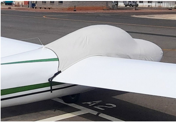
Schweizer 2-32 Canopy/Nose Cover