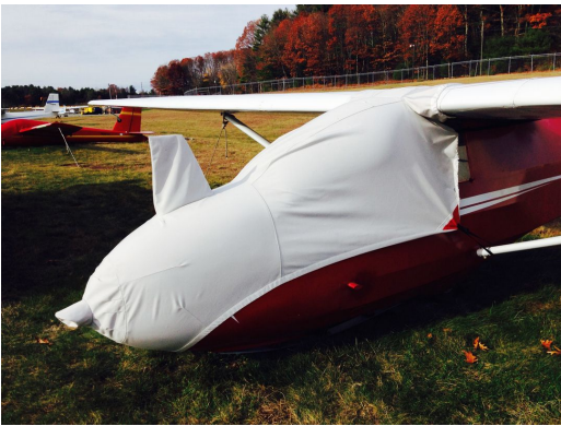
Schweizer SGS 2-33A Canopy/Nose Cover