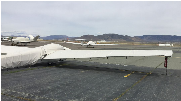
Schweizer SGS 1-26B Cover Set

WINTER USE MATERIAL - Made with Solution-Dyed Polyester fabric, this option is intended for seasonal use to aid in deicing, rain mitigation, or for occasional travel. The material is lighter and more compact, but more susceptible to UV damage and may have a shorter useful life if used continuously outside than the all-year use material.