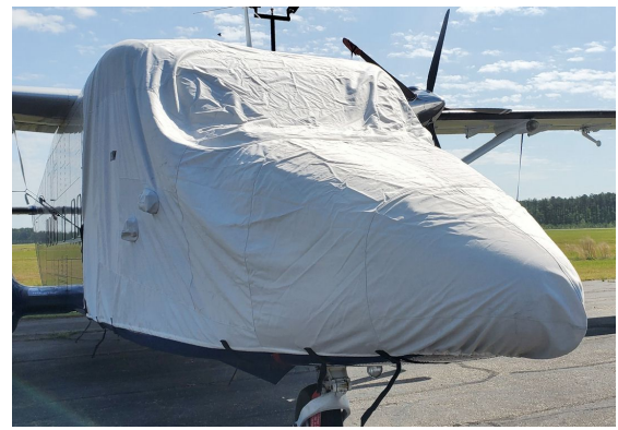
Short Brothers Sherpa, Skyvan, 330 & 360 (C-23) Forward Fuselage/Nose Cover