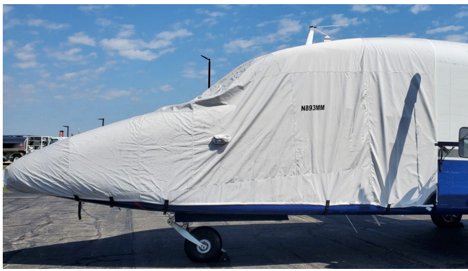
Short Brothers Sherpa, Skyvan, 330 & 360 (C-23) Forward Fuselage/Nose Cover