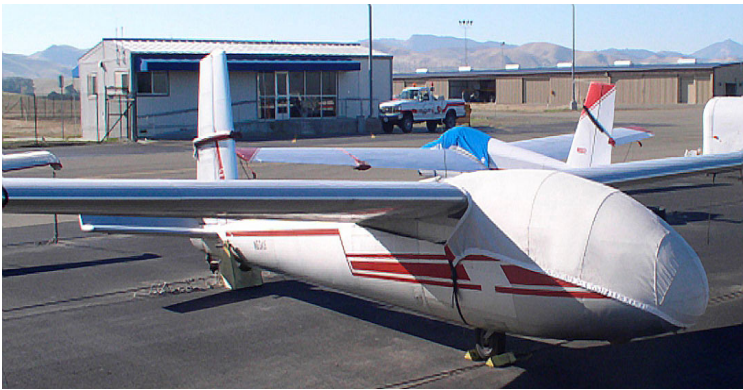
Blanik L13 Canopy/Nose Cover