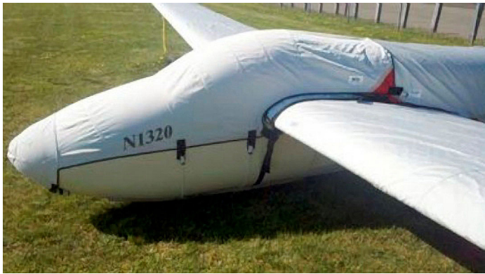
Schweizer SGS 1-26B Canopy/Nose, Wings & Empennage Covers

The material is very reflective, and tests show that the cabin interior temperature can be reduced to near-ambient temperature on the hottest of days. It is water, ice and snow repellent, yet breathable to allow moisture to escape from between the cover and the aircraft surface.