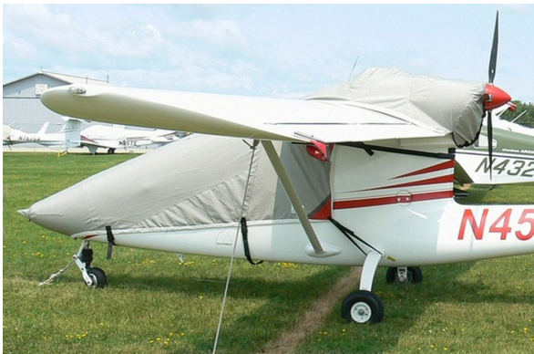
Sky Arrow Canopy/Nose & Engine Covers