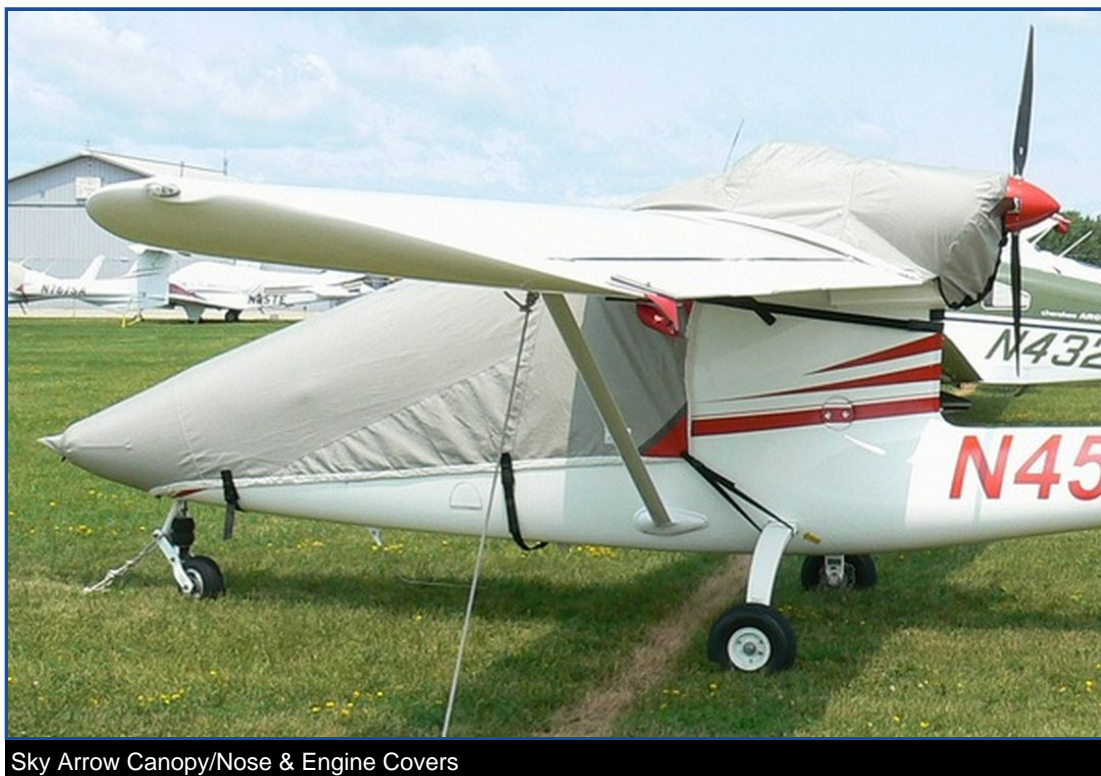
Sky Arrow Canopy/Nose &amp; Engine Covers

(iniziative-industriali-magnaghi-aeronautica-spa-SKA.pdf)