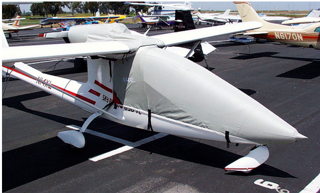
Sky Arrow Canopy & Engine Covers

This cover type is made from Silver Acrylic Sunbrella canvas and is 100% lined with a soft and smooth microfiber. Bruce's Custom Covers developed this material combination especially for aircraft protection. The outer material is medium weight and treated for water resistance, UV resistance and anti-static buildup. The inner lining is a very soft and smooth microfiber to prevent scratching. The material is very reflective, and tests show that the cabin interior temperature can be reduced to near-ambient temperature on the hottest of days. It is water, ice and snow repellent, yet breathable to allow moisture to escape from between the cover and the aircraft surface.