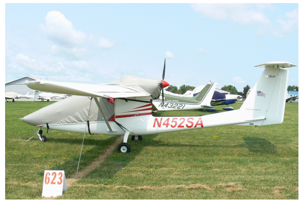
Sky Arrow Canopy & Engine Covers