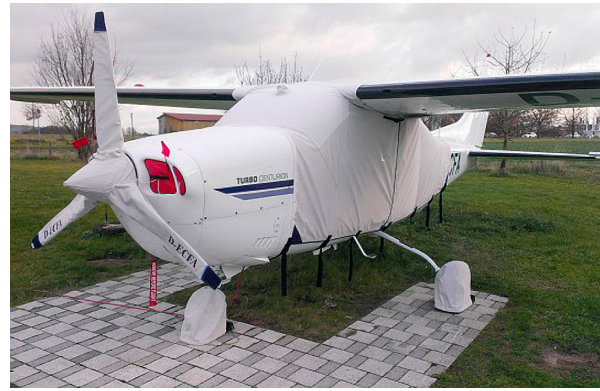
Cessna 210 Extended Canopy Cover, Engine Plugs, Prop and Tire Covers