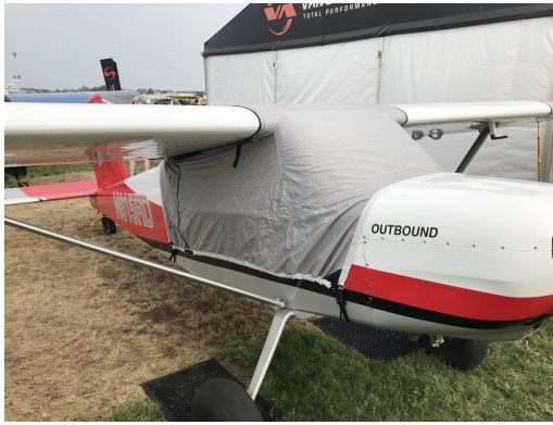
Rans S-21 Travel Canopy Cover