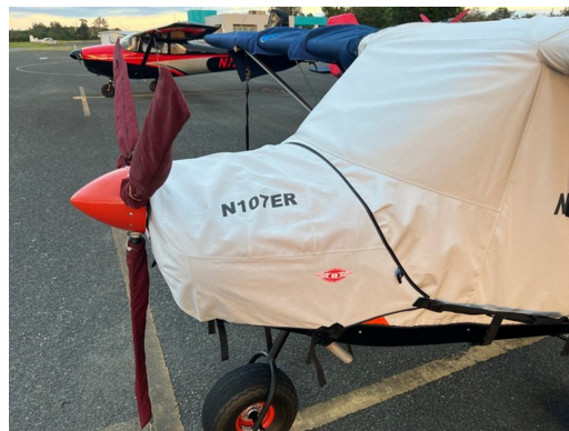
Best Off Skyranger Canopy Cover, Engine Cover