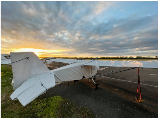
Best Off Skyranger Canopy, Wing & Empennage Covers