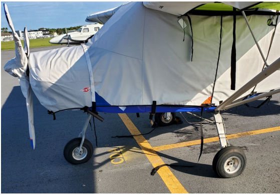
Best Off Skyranger Complete Cover Set