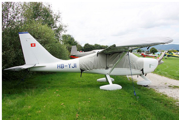
Glstar Canopy, Wings, Horizontal Stab. & Prop Covers