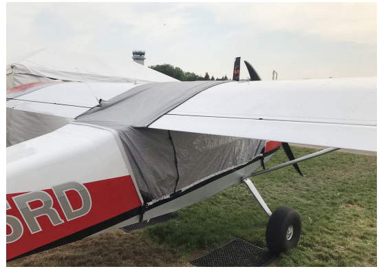
Rans S-21 Travel Canopy Cover