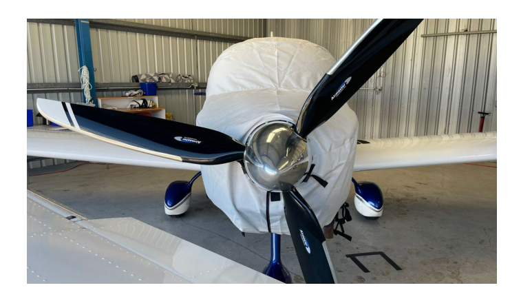
Sling TSI Extended Canopy/Engine Cover