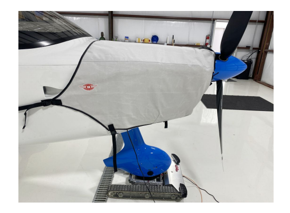
Sling TSI Engine Cover