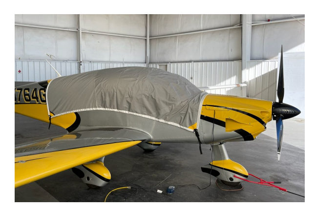
Sling TSI Travel Weight Canopy Cover