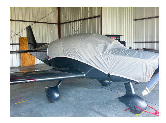
Sling TSI Travel Cover, Light Weight Canopy/Engine Cover

Travel Covers are made with Silver Solution-Dyed Polyester fabric and only lined over the windshield to save weight. The material is lightweight and more compact for easy stowage in the aircraft. The polyester material is water resistant, but only intended for occasional use outside. We also have an ultra lightweight material available for fitted hangar dust covers. For daily outdoor use, the non-travel Sunbrella Cover is the best choice.