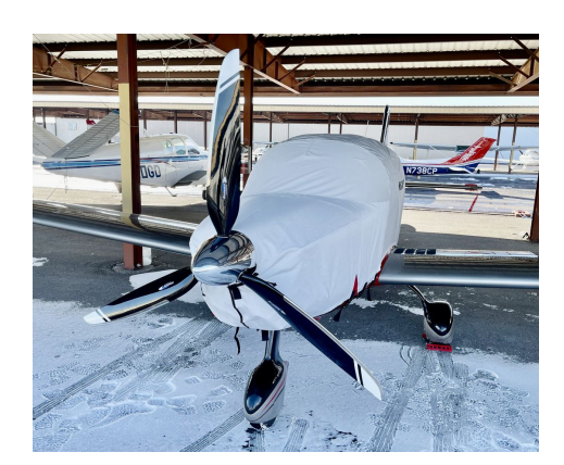
Airplane Factory Sling TSI Extended Canopy/Engine Cover

This cover type is made from Silver Acrylic Sunbrella canvas and is 100% lined with a soft and smooth microfiber. Bruce's Custom Covers developed this material combination especially for aircraft protection. The outer material is medium weight and treated for water resistance, UV resistance and anti-static buildup. The inner lining is a very soft and smooth microfiber to prevent scratching. The material is very reflective, and tests show that the cabin interior temperature can be reduced to near-ambient temperature on the hottest of days. It is water, ice and snow repellent, yet breathable to allow moisture to escape from between the cover and the aircraft surface.