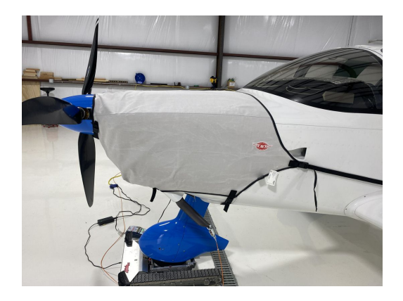
Sling TSI Engine Cover

This cover type is made from Silver Acrylic Sunbrella canvas and is 100% lined with a soft and smooth microfiber. Bruce's Custom Covers developed this material combination especially for aircraft protection. The outer material is medium weight and treated for water resistance, UV resistance and anti-static buildup. The inner lining is a very soft and smooth microfiber to prevent scratching. The material is very reflective, and tests show that the cabin interior temperature can be reduced to near-ambient temperature on the hottest of days. It is water, ice and snow repellent, yet breathable to allow moisture to escape from between the cover and the aircraft surface.