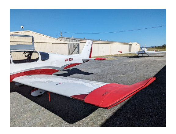
Sling TSI Wing & Horizontal Stabilizer Tip Pads