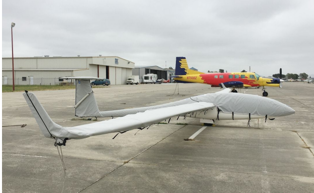
DG-505 Canopy/Nose, Wing, Empennage & Horiz. Stab. Covers

WINTER USE MATERIAL - Made with Solution-Dyed Polyester fabric, this option is intended for seasonal use to aid in deicing, rain mitigation, or for occasional travel. The material is lighter and more compact, but more susceptible to UV damage and may have a shorter useful life if used continuously outside than the all-year use material.