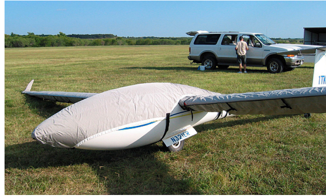
Canopy/Nose Cover, Wings and Horizontal Stab Covers