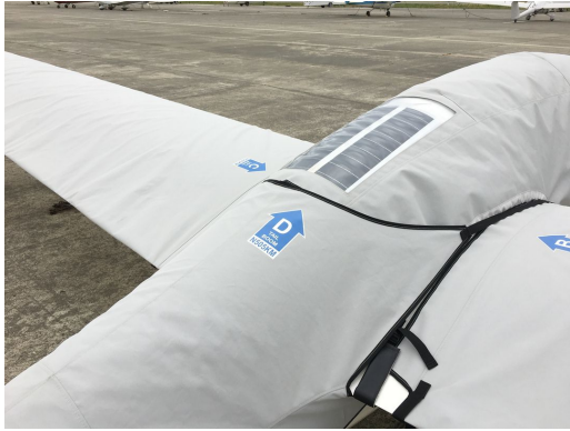
DG-505 Full Cover Set