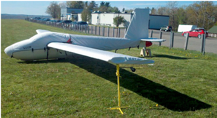
SGS 1-26B Canopy/Nose, Empennage & Wing Covers