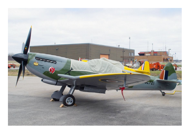
Supermarine Spitfire Mk 14 Canopy Cover

Supermarine Spitfire Mark 16 Canopy Cover