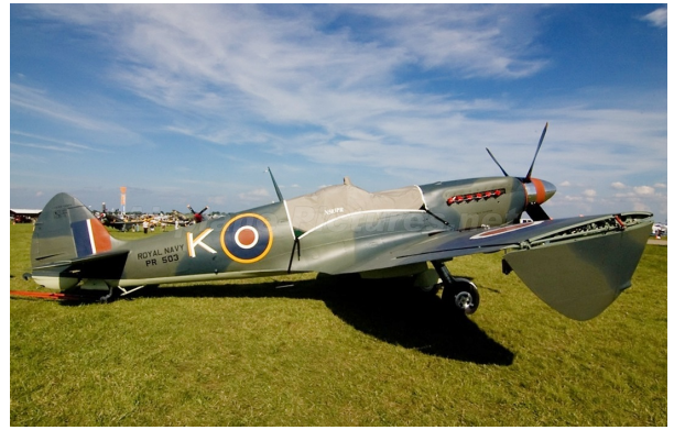
Supermarine Spitfire Mk IX Canopy Cover