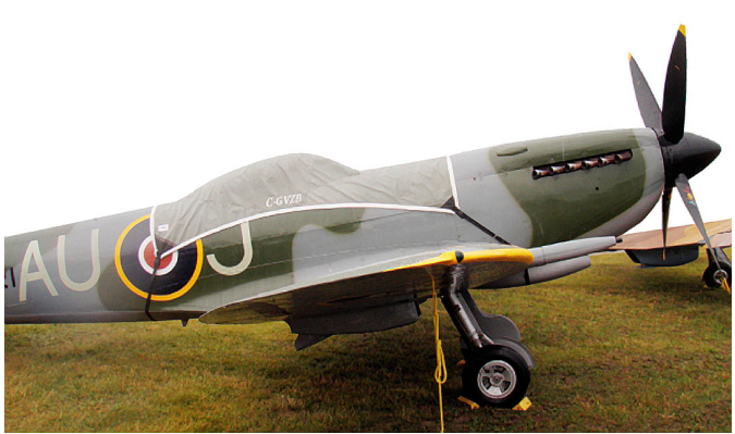
Supermarine Spitfire Mark 16 Canopy Cover