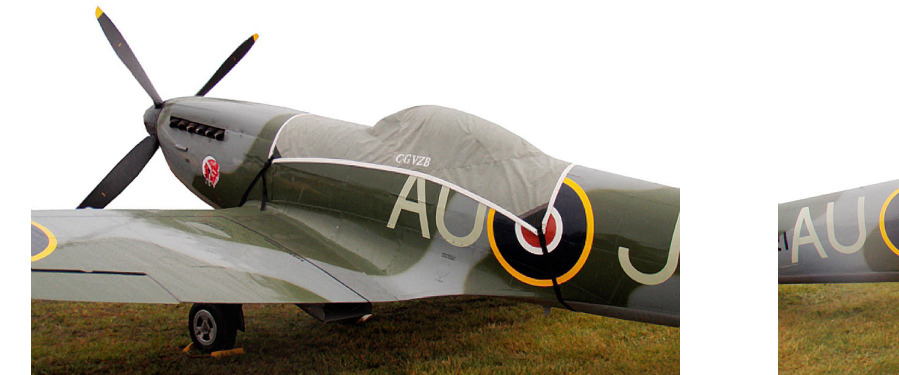
Supermarine Spitfire Mark 16 Canopy Cover

Travel Covers are made with Silver Solution-Dyed Polyester fabric and only lined over the windshield to save weight. The material is lightweight and more compact for easy stowage in the aircraft. The polyester material is water resistant, but only intended for occasional use outside. We also have an ultra lightweight material available for fitted hangar dust covers. For daily outdoor use, the non-travel Sunbrella Cover is the best choice.