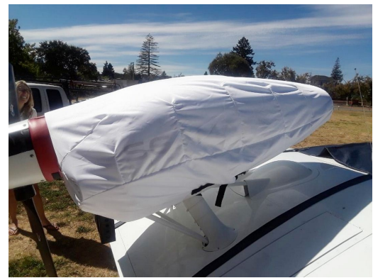
Seamax M22 Engine Cover, test fit cover