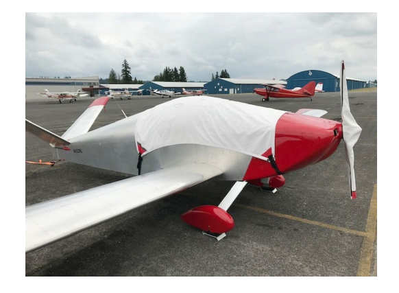
Sonex Xenos Canopy & Prop Cover