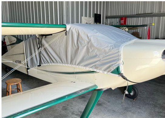
Sorrell SNS-7 Hiperbipe Over The Top Travel Canopy Cover

Travel Covers are made with Silver Solution-Dyed Polyester fabric and only lined over the windshield to save weight. The material is lightweight and more compact for easy stowage in the aircraft. The polyester material is water resistant, but only intended for occasional use outside. We also have an ultra lightweight material available for fitted hangar dust covers. For daily outdoor use, the non-travel Sunbrella Cover is the best choice.