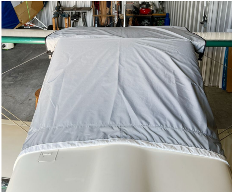
Sorrell SNS-7 Hiperbipe Over The Top Travel Canopy Cover