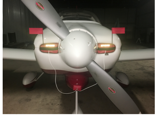
Van's Aircraft RV-7A Engine Inlet Plugs