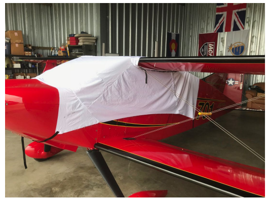
Sorrell Hiperbipe Canopy Cover (test fit cover)