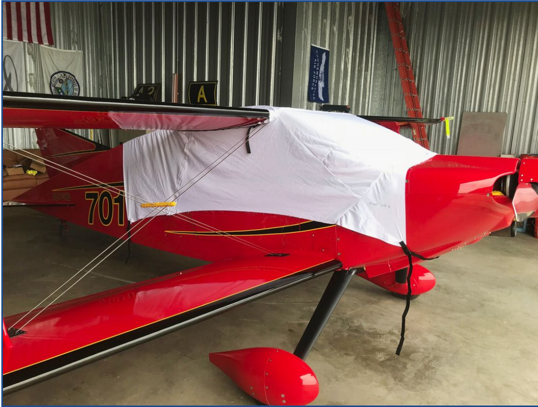
Sorrell Hiperbipe Canopy Cover (test fit cover)