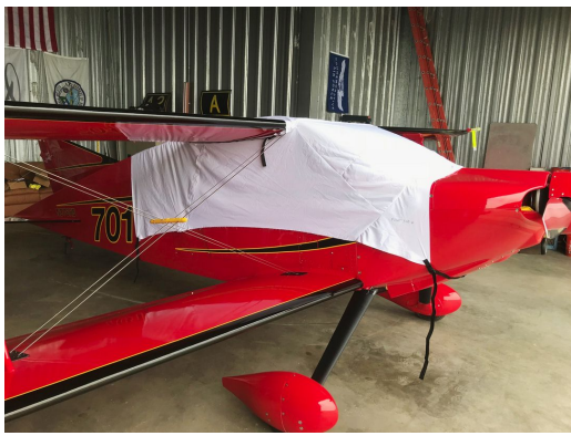
Sorrell Hiperbipe Canopy Cover (test fit cover)