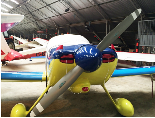
Van's RV-6 Engine Inlet Plugs

Engine Inlet Plugs are custom fit for your Sorrell Hiperbipe SNS-7 intakes, made with heavy-duty vinyl material, and stuffed with a single block of sculpted urethane foam. Each plug has a zipper that allows the foam to be removed and dried if necessary. Engine plugs have warning flags that are visible from the cockpit or 'remove before flight' streamers sewn onto the face of the plugs. Most plugs are imprinted with the aircraft registration number in black for an extra charge. Storage bag NOT included. Engine plugs may be inserted after flight when the engine is still warm. Engine Inlet Plugs are commonly referred to as Cowl Plugs, Intake Plugs, Cowl Blocks, Engine Blocks, and Engine Bungs.