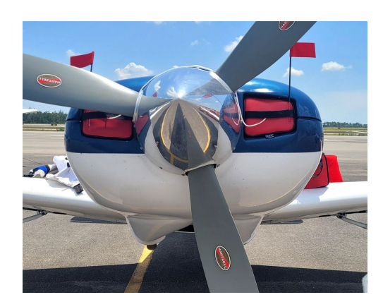
Micco SP20 Engine Inlet Plugs