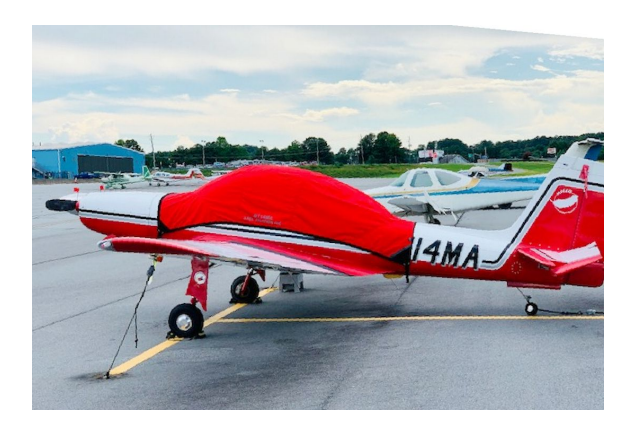
Micco SP20 Canopy Cover

The Micco SP20 Canopy/Engine Cover is a one-piece cover (100% lined with microfiber) that is a combination of the Canopy Cover and Engine Cover. This cover will enclose the engine cowl and will extend aft to cover all of the windows. This cover type is made from Silver Acrylic Sunbrella canvas and is 100% lined with a soft and smooth microfiber. Bruce's Custom Covers developed this material combination especially for aircraft protection. The outer material is medium weight and treated for water resistance, UV resistance and anti-static buildup. The inner lining is a very soft and smooth microfiber to prevent scratching. The material is very reflective, and tests show that the cabin interior temperature can be reduced to near-ambient temperature on the hottest of days. It is water, ice and snow repellent, yet breathable to allow moisture to escape from between the cover and the aircraft surface.