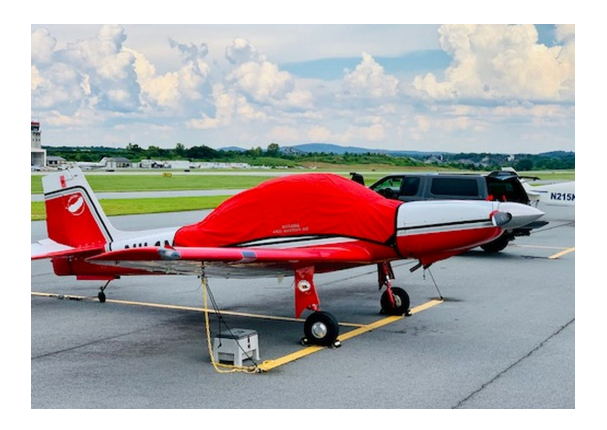
Micco SP20 Canopy Cover