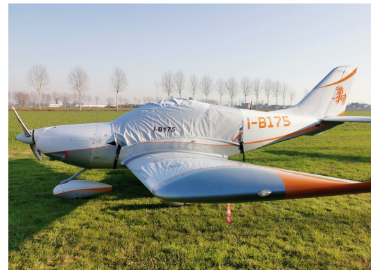
CZAW Sportcruiser Canopy Cover