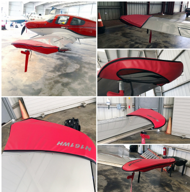
Cirrus SR22 Wingtip Pads, G5 Models

Designed to prevent damage to the aircraft extremities in crowded hangars, these products are made of bright red Naugahyde and thickly padded with a sandwich of closed cell foam.