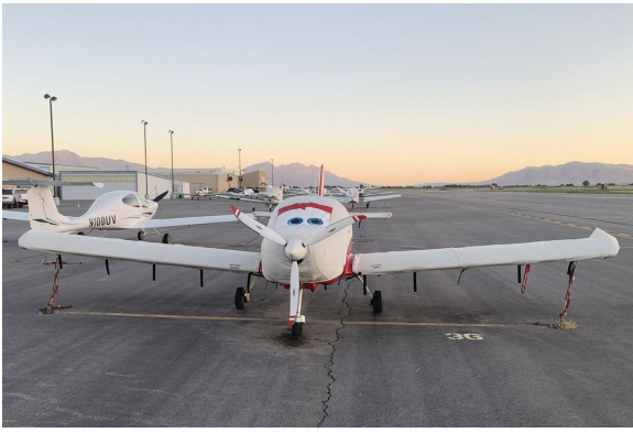
SportCruiser Canopy/Engine & Wing Covers