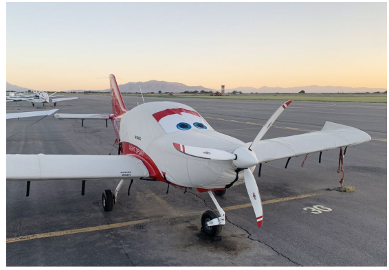
SportCruiser Canopy/Engine & Wing Covers