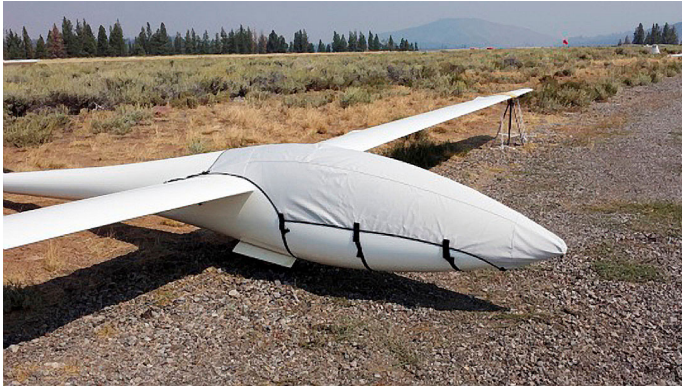
ASW-20C Canopy/Nose Cover

This cover type is made from Silver Acrylic Sunbrella canvas and is 100% lined with a soft and smooth microfiber. Bruce's Custom Covers developed this material combination especially for aircraft protection. The outer material is medium weight and treated for water resistance, UV resistance and anti-static buildup. The inner lining is a very soft and smooth microfiber to prevent scratching. The material is very reflective, and tests show that the cabin interior temperature can be reduced to near-ambient temperature on the hottest of days. It is water, ice and snow repellent, yet breathable to allow moisture to escape from between the cover and the aircraft surface.