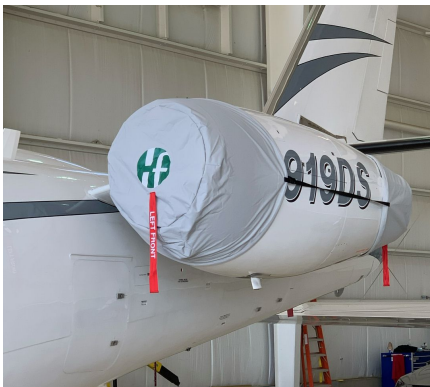
ASTRA SPX Engine Covers with TR's

The Israel Aircraft Industries Astra SPX Bikini Style Engine Covers are a single-piece design using a soft and smooth stretchy and fabric. The cover stretches tightly over both the intake and exhaust, installing quickly and easily. These covers are designed to be used as hangar dust covers and have a useful life of approximately one year.