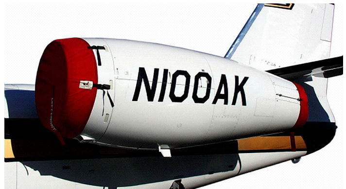
Engine Cover Set for the Astra