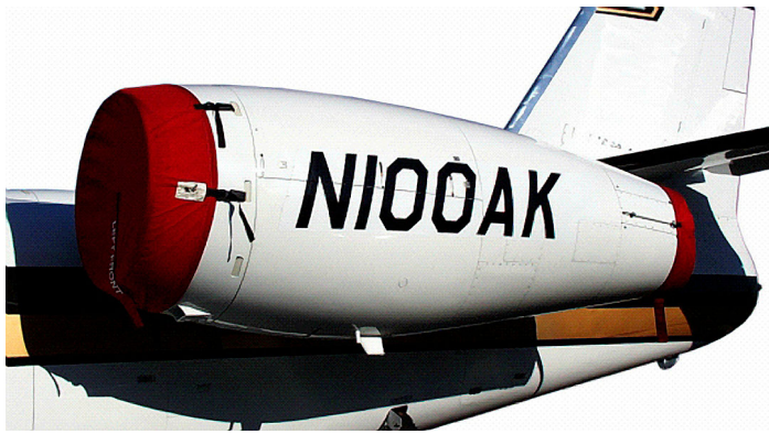
Engine Cover Set for the Astra