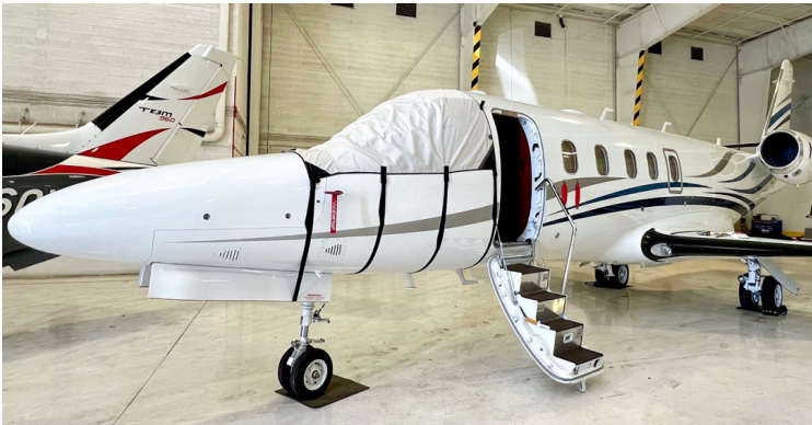
Astron SPX Cockpit Cover

This cover type is made from Silver Acrylic Sunbrella canvas and is 100% lined with a soft and smooth microfiber. Bruce's Custom Covers developed this material combination especially for aircraft protection. The outer material is medium weight and treated for water resistance, UV resistance and anti-static buildup. The inner lining is a very soft and smooth microfiber to prevent scratching. The material is very reflective, and tests show that the cabin interior temperature can be reduced to near-ambient temperature on the hottest of days. It is water, ice and snow repellent, yet breathable to allow moisture to escape from between the cover and the aircraft surface.