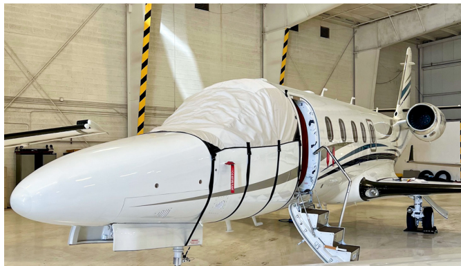
Astra SPX Cockpit Cover

This cover type is made from Silver Acrylic Sunbrella canvas and is 100% lined with a soft and smooth microfiber. Bruce's Custom Covers developed this material combination especially for aircraft protection. The outer material is medium weight and treated for water resistance, UV resistance and anti-static buildup. The inner lining is a very soft and smooth microfiber to prevent scratching. The material is very reflective, and tests show that the cabin interior temperature can be reduced to near-ambient temperature on the hottest of days. It is water, ice and snow repellent, yet breathable to allow moisture to escape from between the cover and the aircraft surface.