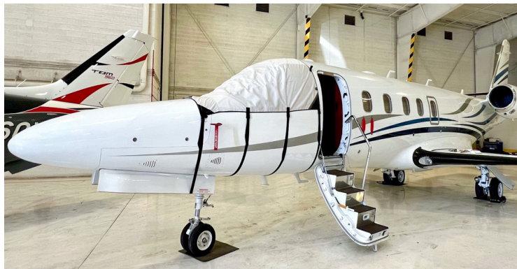
Astra SPX Cockpit Cover