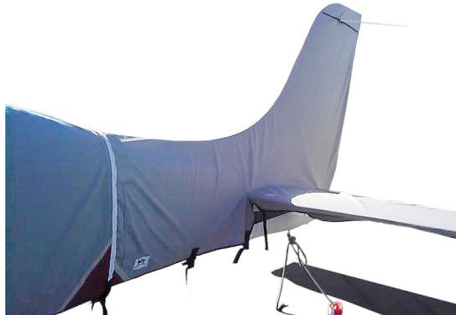
Cirrus SR20 Empennage Cover (covers tail boom, vertical and horizontal stabilizers)

WINTER USE MATERIAL - Made with Solution-Dyed Polyester fabric, this option is intended for seasonal use to aid in deicing, rain mitigation, or for occasional travel. The material is lighter and more compact, but more susceptible to UV damage and may have a shorter useful life if used continuously outside than the all-year use material.