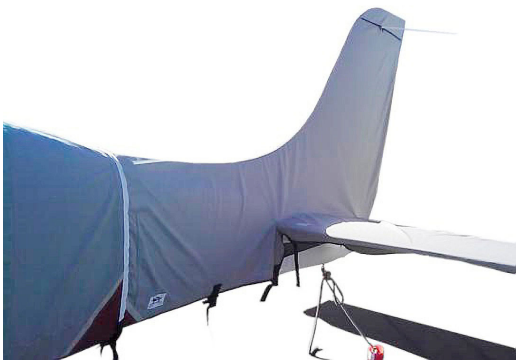
Cirrus SR20 Empennage Cover (covers tail boom, vertical and horizontal stabilizers)