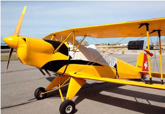
Bucker Jungmann Canopy Cover