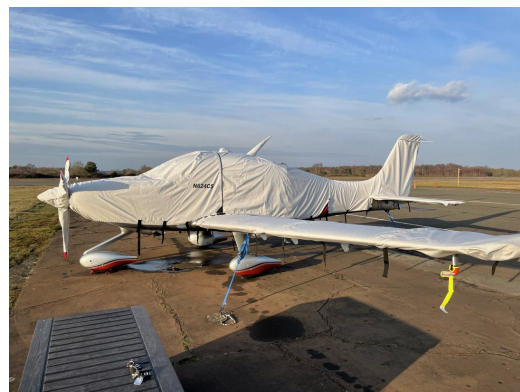
Cirrus SR-22 Complete Cover Set

WINTER USE MATERIAL - Made with Solution-Dyed Polyester fabric, this option is intended for seasonal use to aid in deicing, rain mitigation, or for occasional travel. The material is lighter and more compact, but more susceptible to UV damage and may have a shorter useful life if used continuously outside than the all-year use material.