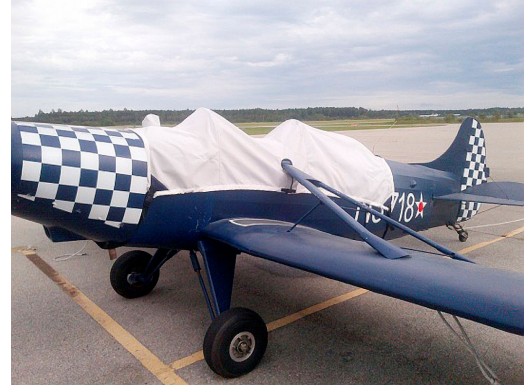
Spezio Tuholer Canopy Cover