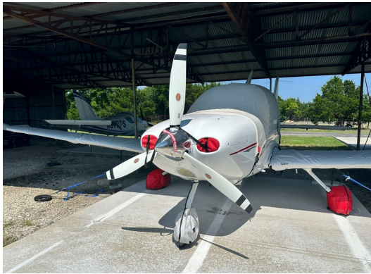
Cirrus SR-22 Wheelpant Covers

Designed to prevent damage to the aircraft extremities in crowded hangars, these products are made of bright red Naugahyde and thickly padded with a sandwich of closed cell foam.