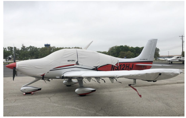
Cirrus SR-22 Canopy/Engine & Wing Covers