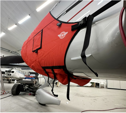
Cirrus SR-22 Insulated Engine Cover