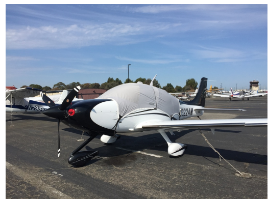
Cirrus SR-20/22 Travel Cover, Light Travel Canopy Cover