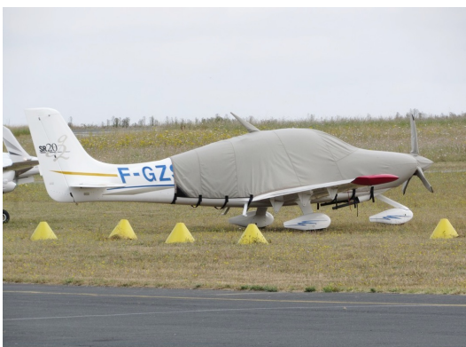
Cirrus SR-22 Extended Canopy/Engine Cover, Prop Cover, Wingtip Pads

This cover type is made from Silver Acrylic Sunbrella canvas and is 100% lined with a soft and smooth microfiber. Bruce's Custom Covers developed this material combination especially for aircraft protection. The outer material is medium weight and treated for water resistance, UV resistance and anti-static buildup. The inner lining is a very soft and smooth microfiber to prevent scratching. The material is very reflective, and tests show that the cabin interior temperature can be reduced to near-ambient temperature on the hottest of days. It is water, ice and snow repellent, yet breathable to allow moisture to escape from between the cover and the aircraft surface.