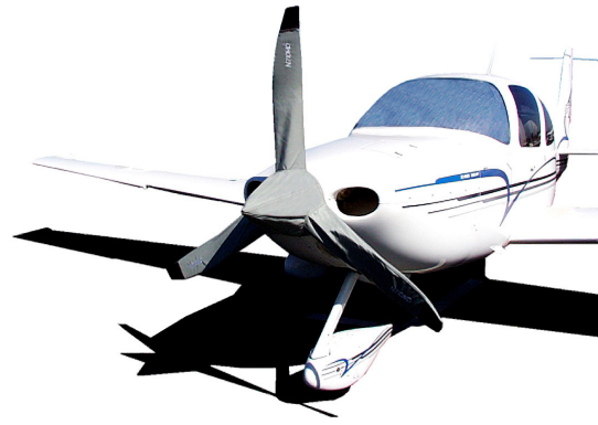
Cirrus SR-22 Propellor/Spinner Cover & Windshield Heatshield