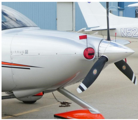
Cirrus SR20 Engine Inlet Plugs