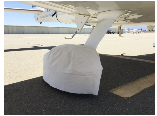
Cirrus Main Gear Wheelpant Cover