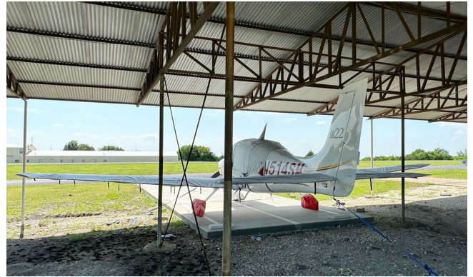
Cirrus SR-22 Canopy, Wing & Wheelpan Covers