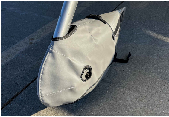
Cirrus SR22 Abbreviated Front Wheelpant (For Tow Bar Protection)