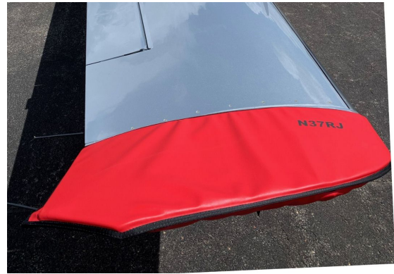
Cirrus SR-22 Wingtip Pads