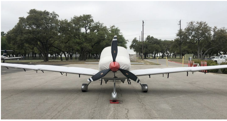
Cirrus SR-22 Canopy/Engine & Wing Covers