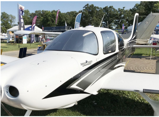
Cirrus SR-22 Cockpit HeatShields

Windshield Heatshields are interior sunshades for an aircraft's front windshield. The product is a unique composite of closed-cell foam with a silver mylar finish. The semi-rigid design is stiff enough to stand along the inside of the windshield using sun visors or window framing. It folds up flat and easily stores in the included storage sleeve. Some designs may require velcro and suction cups or split right and left sides. A Heatshield is an excellent short-term remedy for cockpit overheating. An external fabric cover is far more effective and practical for long-term protection.