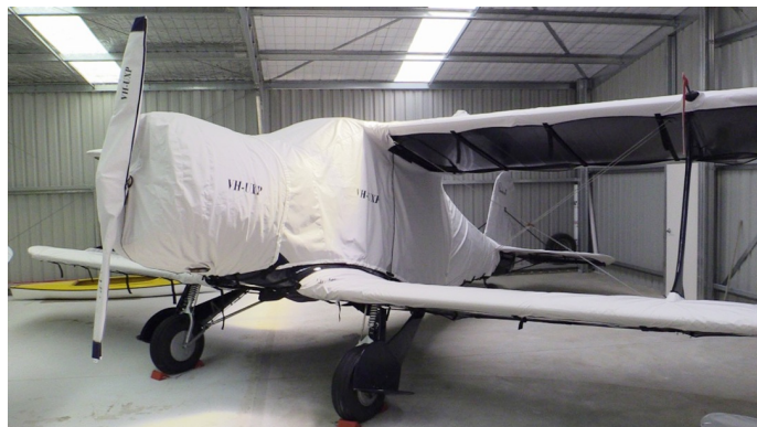
Beech Staggerwing Complete Cover Set

This cover type is made from Silver Acrylic Sunbrella canvas and is 100% lined with a soft and smooth microfiber. Bruce's Custom Covers developed this material combination especially for aircraft protection. The outer material is medium weight and treated for water resistance, UV resistance and anti-static buildup. The inner lining is a very soft and smooth microfiber to prevent scratching. The material is very reflective, and tests show that the cabin interior temperature can be reduced to near-ambient temperature on the hottest of days. It is water, ice and snow repellent, yet breathable to allow moisture to escape from between the cover and the aircraft surface.