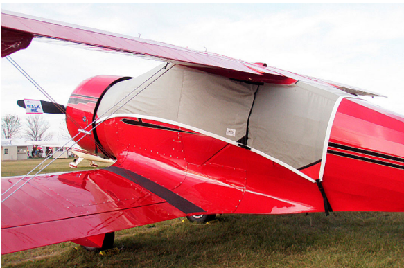
Beech Staggerwing Canopy Cover

This cover type is made from Silver Acrylic Sunbrella canvas and is 100% lined with a soft and smooth microfiber. Bruce's Custom Covers developed this material combination especially for aircraft protection. The outer material is medium weight and treated for water resistance, UV resistance and anti-static buildup. The inner lining is a very soft and smooth microfiber to prevent scratching. The material is very reflective, and tests show that the cabin interior temperature can be reduced to near-ambient temperature on the hottest of days. It is water, ice and snow repellent, yet breathable to allow moisture to escape from between the cover and the aircraft surface.