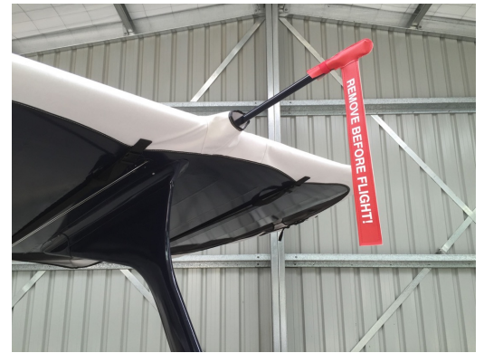
Beech Staggerwing Complete Cover Set, Upper Wing Detail