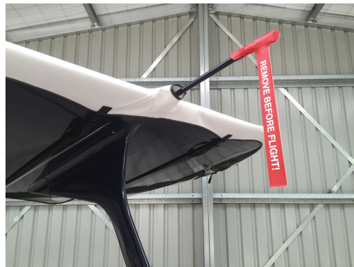
Beech Staggerwing Complete Cover Set, Upper Wing Detail