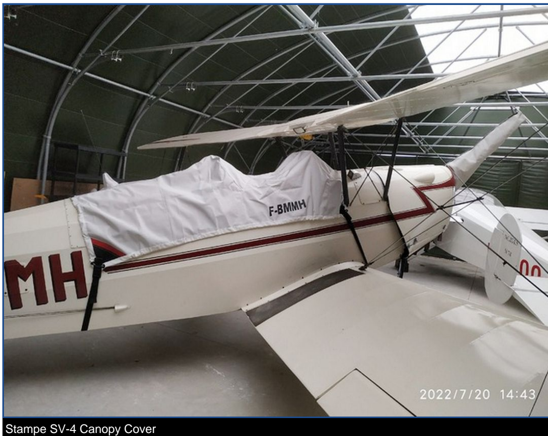
Stampe SV-4 Canopy Cover