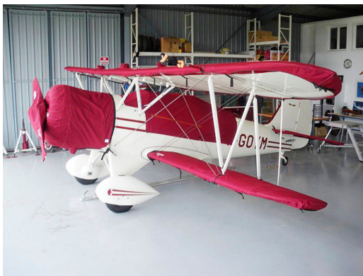
Waco UPF-7 Canopy, Wings, Stab's, Engine, Prop Covers