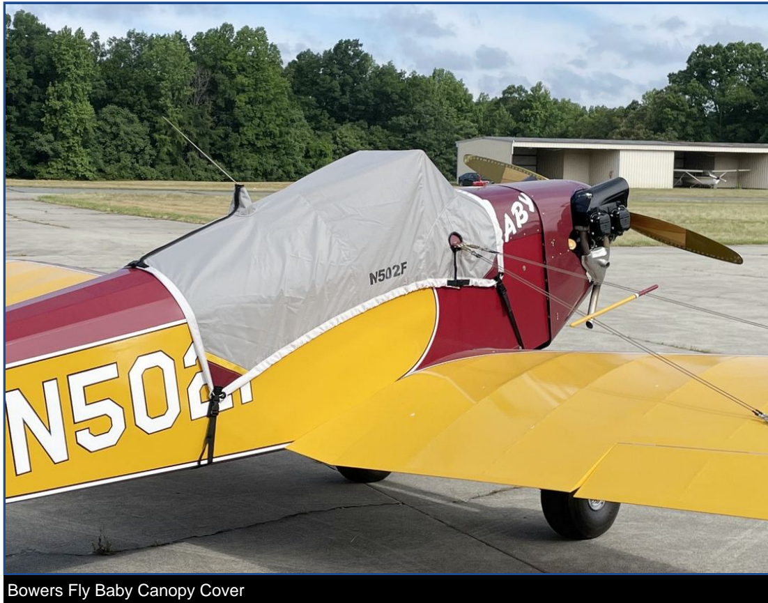
Bowers Fly Baby Canopy Cover