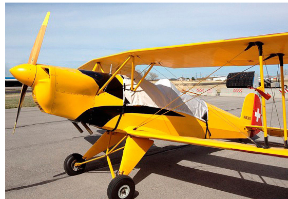
Bucker Jungmann Canopy Cover