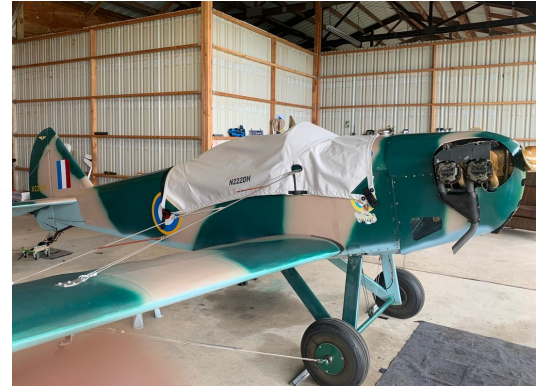
Bowers Fly Baby Canopy Cover