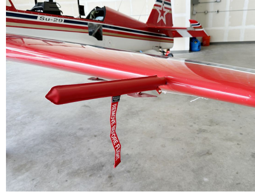
Sukhoi SU-26 Pitot Cover