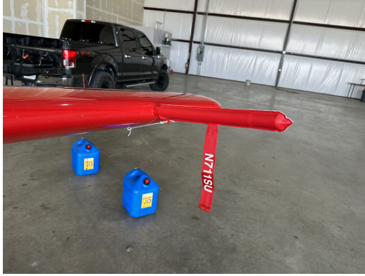
Sukhoi SU-26 Pitot Cover

Sukhoi SU-26 Pitot Tube Covers , NOT HEAT RESISTANT TYPE, are made of Naugahyde vinyl, and are designed to cover the entire pitot assembly. Slipping over the tube, the cover tightens around the base with a Velcro strap detail. A "Remove Before Flight" streamer is attached to the cover. Heat Resistant Pitot Covers are an upgrade to this design, and help prevent the pitot cover from melting onto the tube if the pitot heat is accidentally turned on while installed. If you want the set tethered together, please let us know.