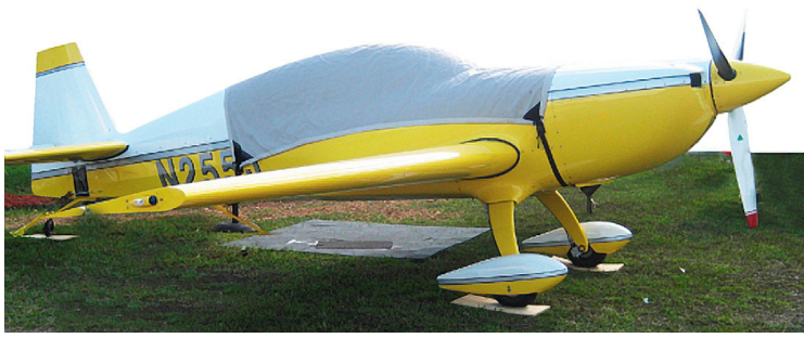
Xtremair Canopy Cover