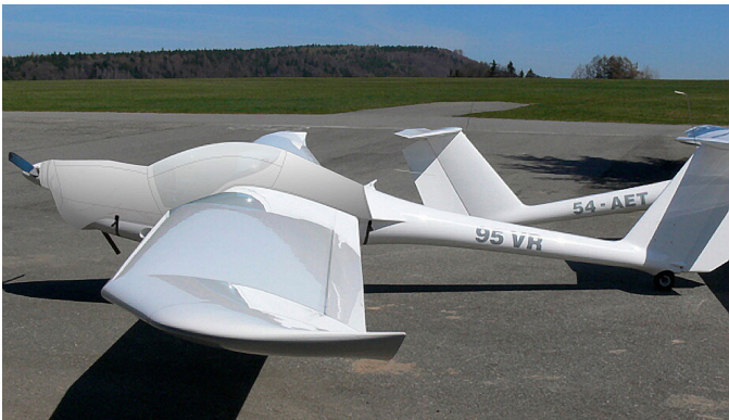
Lambda Canopy/Engine Cover (illustration)