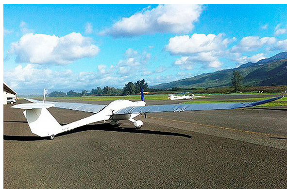
Lambada Canopy/Engine Cover and Wing Covers