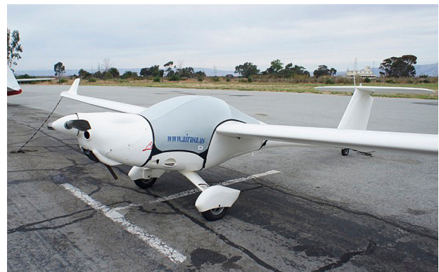
Lambda Canopy Cover