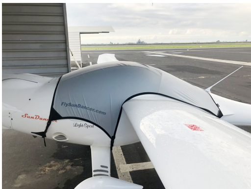
SUNDANCER Travel Cover with custom Imprint