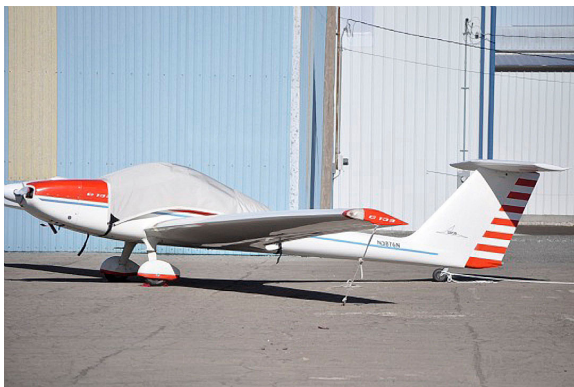
Grob 109 Canopy Cover