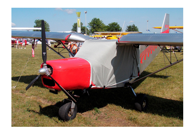
Zenith CH701 Standard Canopy Cover