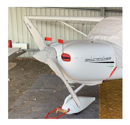
Cessna Skycatcher Prop/Spinner Cover, Engine Plugs