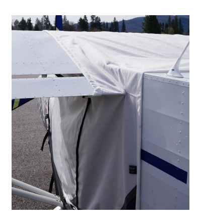
Savannah VG Canopy Cover