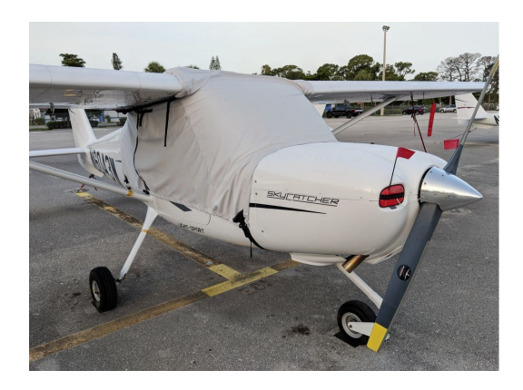
Cessna Skycatcher 162 Canopy Cover and Engine Inlet Plugs

Engine Inlet Plugs are custom fit for your Savannah VG & S Models intakes, made with heavy-duty vinyl material, and stuffed with a single block of sculpted urethane foam. Each plug has a zipper that allows the foam to be removed and dried if necessary. Engine plugs have warning flags that are visible from the cockpit or 'remove before flight' streamers sewn onto the face of the plugs. Most plugs are imprinted with the aircraft registration number in black for an extra charge. Storage bag NOT included. Engine plugs may be inserted after flight when the engine is still warm. Engine Inlet Plugs are commonly referred to as Cowl Plugs, Intake Plugs, Cowl Blocks, Engine Blocks, and Engine Bungs.