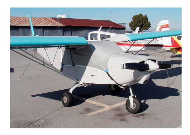
Zenith 801 Standard Canopy Cover

This cover type is made from Silver Acrylic Sunbrella canvas and is 100% lined with a soft and smooth microfiber. Bruce's Custom Covers developed this material combination especially for aircraft protection. The outer material is medium weight and treated for water resistance, UV resistance and anti-static buildup. The inner lining is a very soft and smooth microfiber to prevent scratching. The material is very reflective, and tests show that the cabin interior temperature can be reduced to near-ambient temperature on the hottest of days. It is water, ice and snow repellent, yet breathable to allow moisture to escape from between the cover and the aircraft surface.