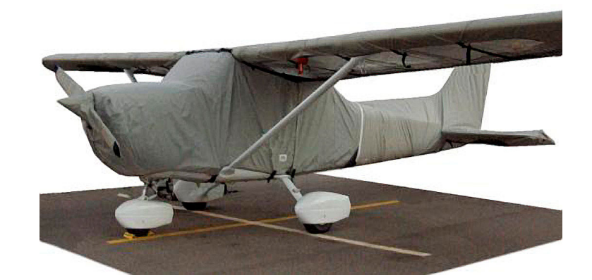
Cessna 172 Propellor Cover, 2 Blade