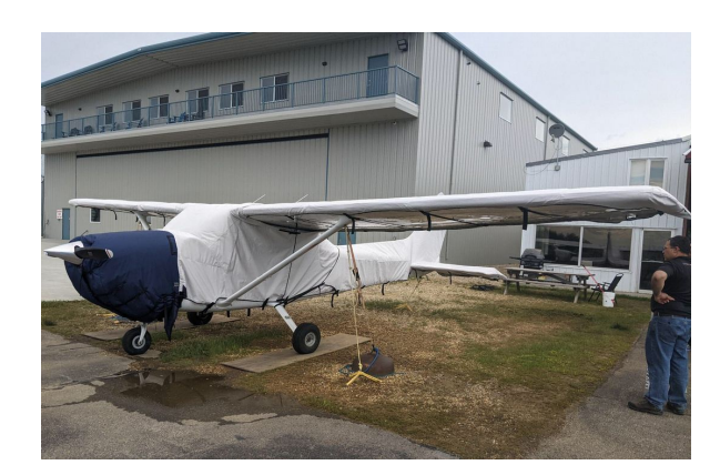
Cessna 172 Extended Canopy Cover, Wing & Empennage Covers

WINTER USE MATERIAL - Made with Solution-Dyed Polyester fabric, this option is intended for seasonal use to aid in deicing, rain mitigation, or for occasional travel. The material is lighter and more compact, but more susceptible to UV damage and may have a shorter useful life if used continuously outside than the all-year use material.