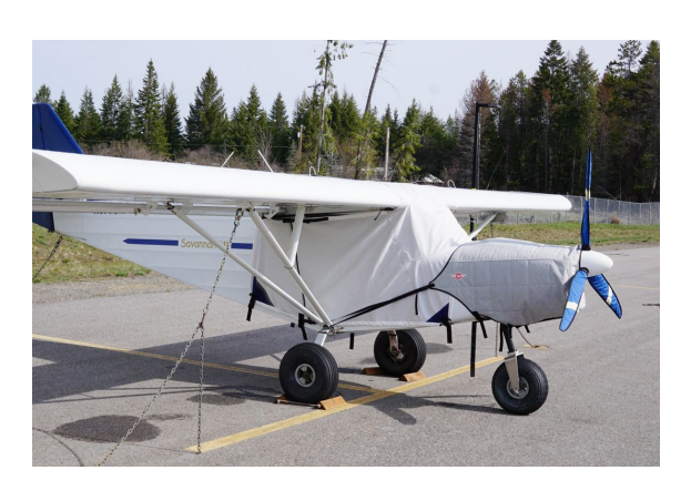
Savannah VG Canopy Cover, Insulated Engine Cover