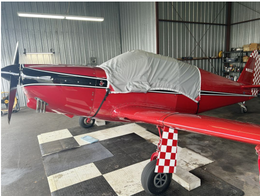
Swift Travel Cover, Light Weight Canopy Cover (Standard Canopy)