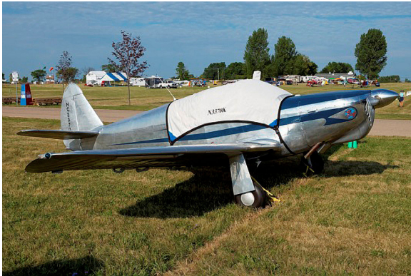
Globe Swift Canopy Cover

This cover type is made from Silver Acrylic Sunbrella canvas and is 100% lined with a soft and smooth microfiber. Bruce's Custom Covers developed this material combination especially for aircraft protection. The outer material is medium weight and treated for water resistance, UV resistance and anti-static buildup. The inner lining is a very soft and smooth microfiber to prevent scratching. The material is very reflective, and tests show that the cabin interior temperature can be reduced to near-ambient temperature on the hottest of days. It is water, ice and snow repellent, yet breathable to allow moisture to escape from between the cover and the aircraft surface.