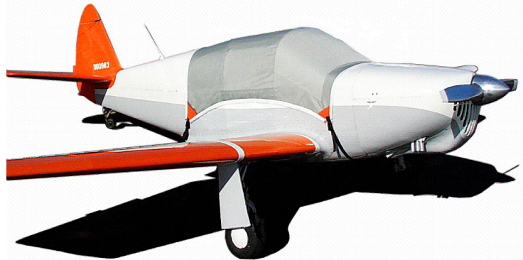
Standard Canopy Cover for Swift