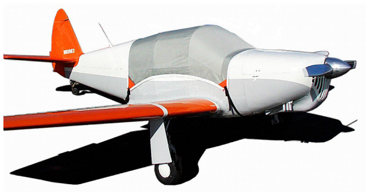
Standard Canopy Cover for Swift

Travel Covers are made with Silver Solution-Dyed Polyester fabric and only lined over the windshield to save weight. The material is lightweight and more compact for easy stowage in the aircraft. The polyester material is water resistant, but only intended for occasional use outside. We also have an ultra lightweight material available for fitted hangar dust covers. For daily outdoor use, the non-travel Sunbrella Cover is the best choice.