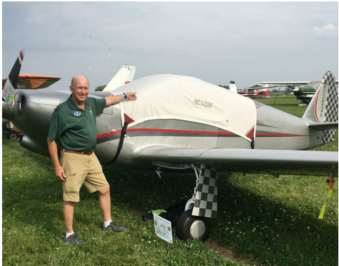
Globe Swift Canopy Cover