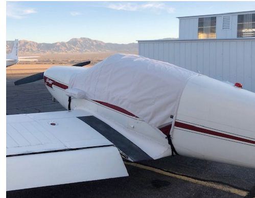
Globe-Temco Swift Canopy Cover, standard type