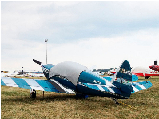
Swift Light Weight Canopy Cover

This cover type is made from Silver Acrylic Sunbrella canvas and is 100% lined with a soft and smooth microfiber. Bruce's Custom Covers developed this material combination especially for aircraft protection. The outer material is medium weight and treated for water resistance, UV resistance and anti-static buildup. The inner lining is a very soft and smooth microfiber to prevent scratching. The material is very reflective, and tests show that the cabin interior temperature can be reduced to near-ambient temperature on the hottest of days. It is water, ice and snow repellent, yet breathable to allow moisture to escape from between the cover and the aircraft surface.