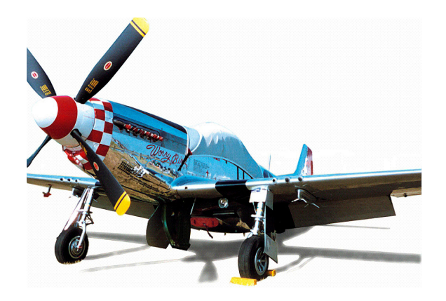
Canopy Cover, Belly & Chin Scoop Plugs

the hottest of days. It is water, ice and snow repellent, yet breathable to allow moisture to escape from between the cover and the aircraft surface.