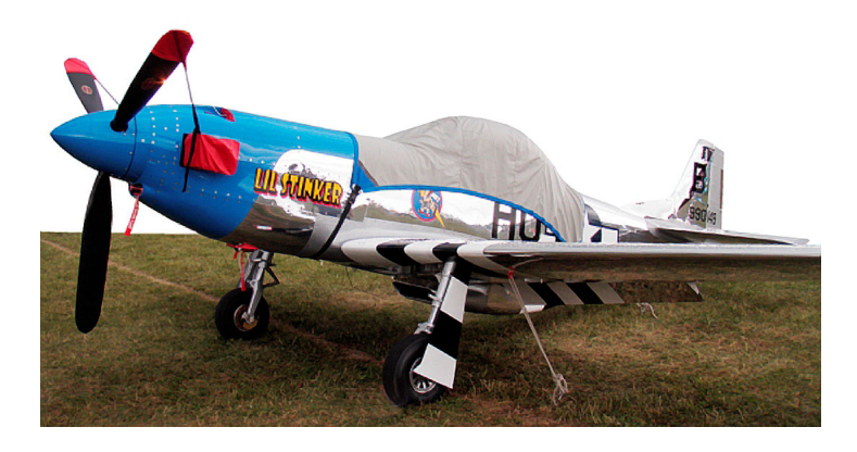
Stewart Mustang Canopy Cover, Prop Tie Downs & Intake Plugs