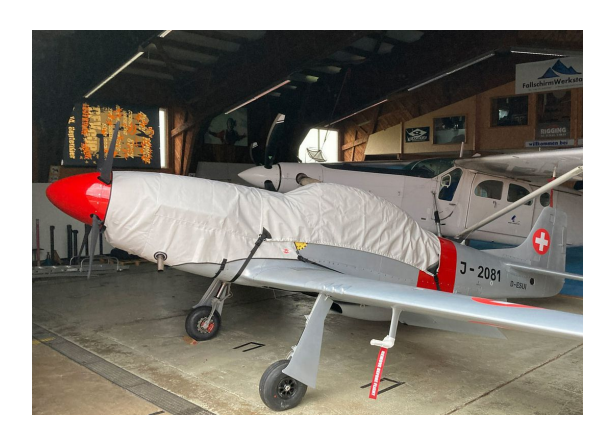
SW-51 Mustang Canopy & Engine Covers

Covers developed this material combination especially for aircraft protection. The outer material is medium weight and treated for water resistance, UV resistance and anti-static buildup. The inner lining is a very soft and smooth microfiber to prevent scratching. The material is very reflective, and tests show that the cabin interior temperature can be reduced to near-ambient temperature on the hottest of days. It is water, ice and snow repellent, yet breathable to allow moisture to escape from between the cover and the aircraft surface.