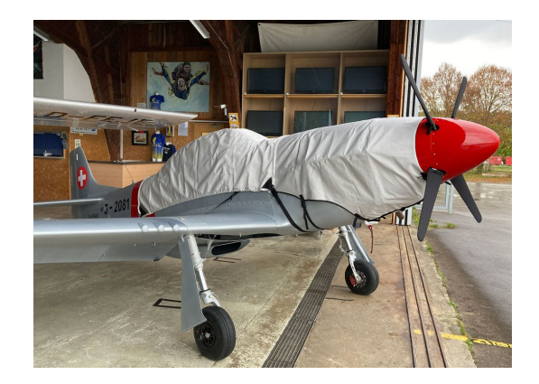
SW-51 Mustang Canopy & Engine Covers