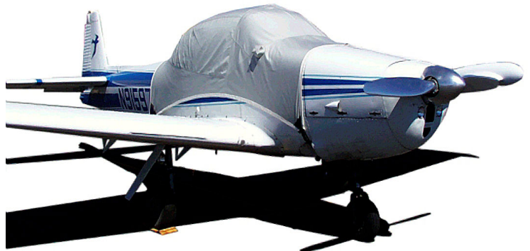
Navion Canopy Cover extends forward to firewall line.