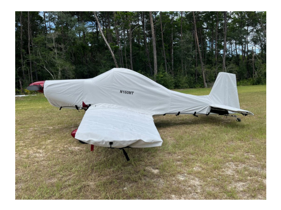
Bushby Mustang Extended Canopy Cover