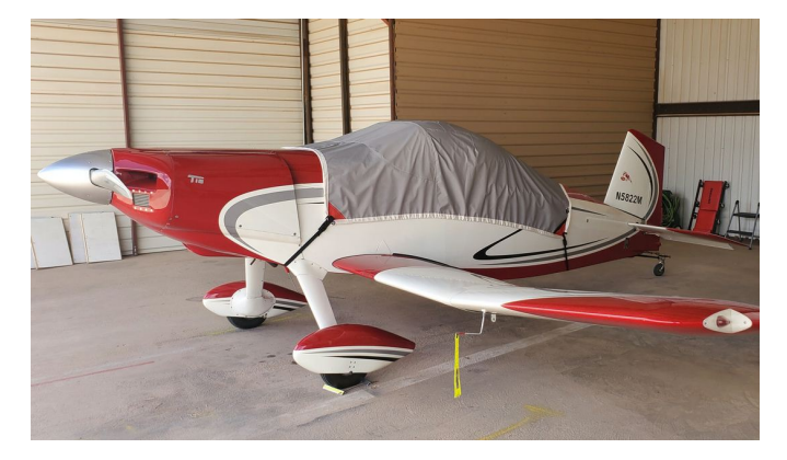
Thorp T-18 Travel Canopy Cover