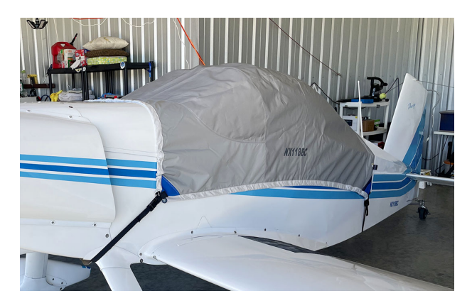
T-18 Travel Cover, Light Weight Canopy Cover (Bubble Canopy)

Travel Covers are made with Silver Solution-Dyed Polyester fabric and only lined over the windshield to save weight. The material is lightweight and more compact for easy stowage in the aircraft. The polyester material is water resistant, but only intended for occasional use outside. We also have an ultra lightweight material available for fitted hangar dust covers. For daily outdoor use, the non-travel Sunbrella Cover is the best choice.