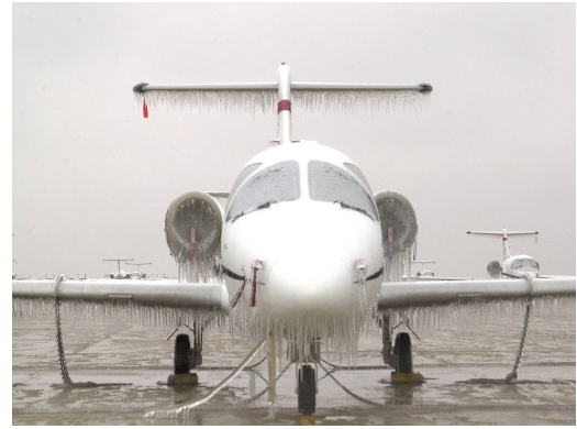
Beechjet 400 Engine Covers