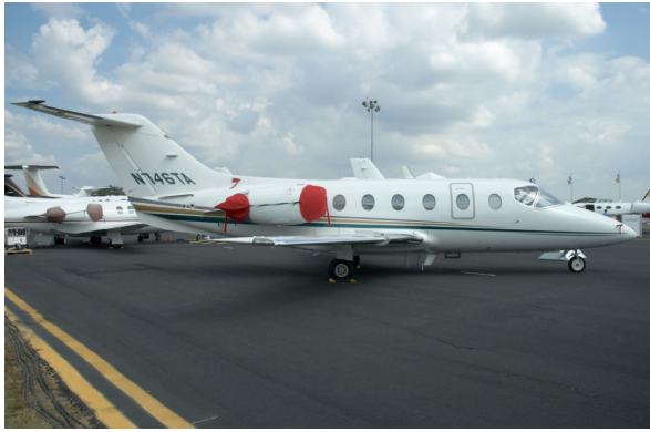
Beechjet 400 Engine Covers

of medium weight nylon which is available in a variety of colors to match the paint trim. Each cover set comes complete with installation and folding instructions. The aircraft's registration number can be silkscreened onto the cover for an extra charge.