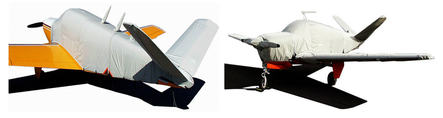
Extended Canopy Cover & Empennage Cover

WINTER USE MATERIAL - Made with Solution-Dyed Polyester fabric, this option is intended for seasonal use to aid in deicing, rain mitigation, or for occasional travel. The material is lighter and more compact, but more susceptible to UV damage and may have a shorter useful life if used continuously outside than the all-year use material.