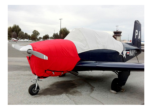
Beech Bonanza Insulated Engine Cover, fully enclosed