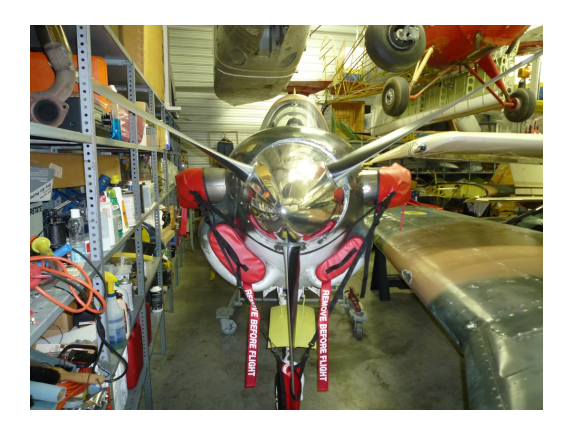
Beech T34C Engine Plugs, Prop Tie/Exhaust Plugs