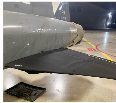
Northrop T-38 Horizontal Stabilizer Cover