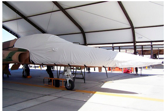
Northup F-5 Talon Canopy/Nose Cover