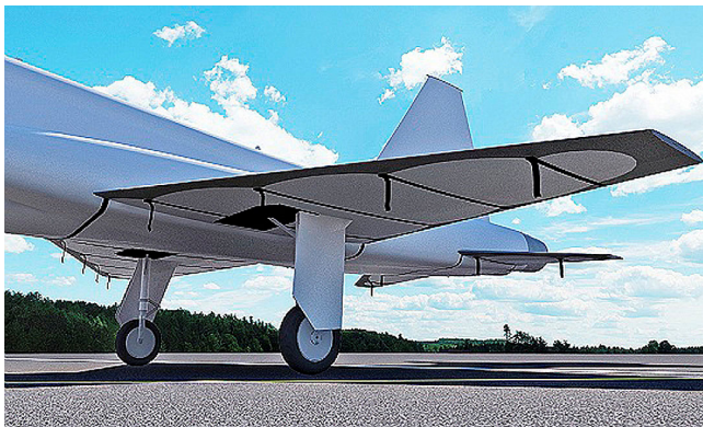
T-38 Talon Wing and Horizontal Stabilizer Covers (3D Rendering)

WINTER USE MATERIAL - Made with Solution-Dyed Polyester fabric, this option is intended for seasonal use to aid in deicing, rain mitigation, or for occasional travel. The material is lighter and more compact, but more susceptible to UV damage and may have a shorter useful life if used continuously outside than the all-year use material.