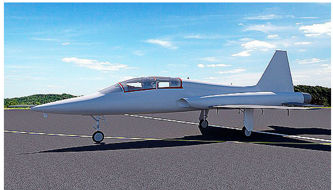
T-38 Talon Wing and Horizontal Stabilizer Covers (3D Rendering)