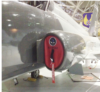
Northrop Grumman T38-C Intake Plugs

The Engine Inlet Plugs are custom fit for your Northrop Talon T-38 Trainer intakes, made with heavy-duty vinyl material, and stuffed with a single block of sculpted urethane foam. Each plug has a zipper that allows the foam to be removed and dried if necessary. Engine plugs have 'remove before flight' streamers sewn onto the face of the plugs. Most plugs are imprinted with the aircraft registration number in black for an extra charge. Storage bag NOT included. Engine plugs may be inserted after flight when the engine is still warm. Engine Inlet Plugs are commonly referred to as Cowl Plugs, Intake Plugs, Cowl Blocks, Engine Blocks, and Engine Bungs.