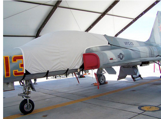
Northrup F5 Talon Canopy Cover