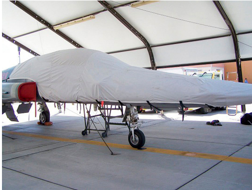
Northrup F5 Talon Canopy Cover

This cover type is made from Silver Acrylic Sunbrella canvas and is 100% lined with a soft and smooth microfiber. Bruce's Custom Covers developed this material combination especially for aircraft protection. The outer material is medium weight and treated for water resistance, UV resistance and anti-static buildup. The inner lining is a very soft and smooth microfiber to prevent scratching. The material is very reflective, and tests show that the cabin interior temperature can be reduced to near-ambient temperature on the hottest of days. It is water, ice and snow repellent, yet breathable to allow moisture to escape from between the cover and the aircraft surface.