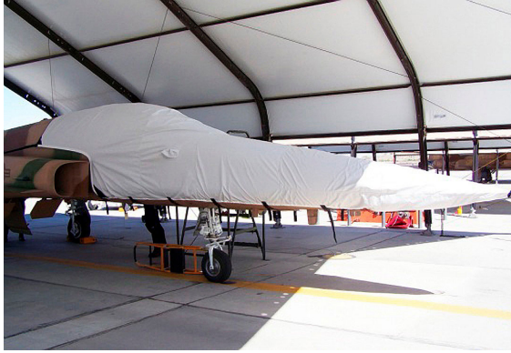
Northup F-5 Talon Canopy/Nose Cover

lightweight and more compact for easy stowage in the aircraft. The polyester material is water resistant, but only intended for occasional use outside. We also have an ultra lightweight material available for fitted hangar dust covers. For daily outdoor use, the non-travel Sunbrella Cover is the best choice.