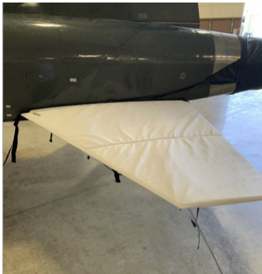
Northrup T-38 Horizontal Stabilizer Covers

WINTER USE MATERIAL - Made with Solution-Dyed Polyester fabric, this option is intended for seasonal use to aid in deicing, rain mitigation, or for occasional travel. The material is lighter and more compact, but more susceptible to UV damage and may have a shorter useful life if used continuously outside than the all-year use material.