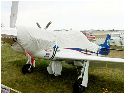
Thunder Mustang Canopy & Engine Cover

This cover type is made from Silver Acrylic Sunbrella canvas and is 100% lined with a soft and smooth microfiber. Bruce's Custom Covers developed this material combination especially for aircraft protection. The outer material is medium weight and treated for water resistance, UV resistance and anti-static buildup. The inner lining is a very soft and smooth microfiber to prevent scratching. The material is very reflective, and tests show that the cabin interior temperature can be reduced to near-ambient temperature on the hottest of days. It is water, ice and snow repellent, yet breathable to allow moisture to escape from between the cover and the aircraft surface.