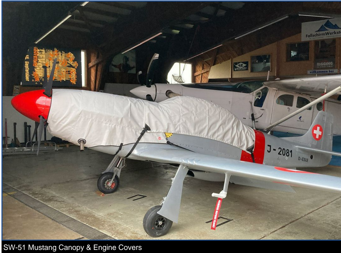
SW-51 Mustang Canopy &amp; Engine Covers