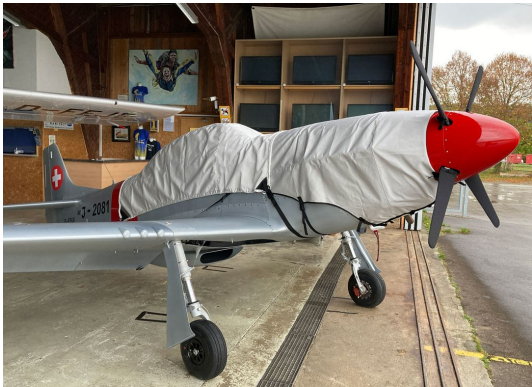
SW-51 Mustang Canopy & Engine Covers