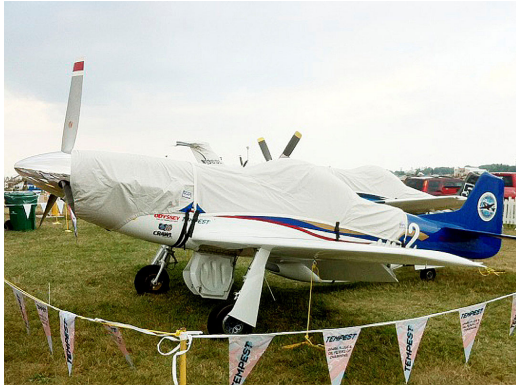
Thunder Mustang Canopy & Engine Cover

This cover type is made from Silver Acrylic Sunbrella canvas and is 100% lined with a soft and smooth microfiber. Bruce's Custom Covers developed this material combination especially for aircraft protection. The outer material is medium weight and treated for water resistance, UV resistance and anti-static buildup. The inner lining is a very soft and smooth microfiber to prevent scratching. The material is very reflective, and tests show that the cabin interior temperature can be reduced to near-ambient temperature on the hottest of days. It is water, ice and snow repellent, yet breathable to allow moisture to escape from between the cover and the aircraft surface.