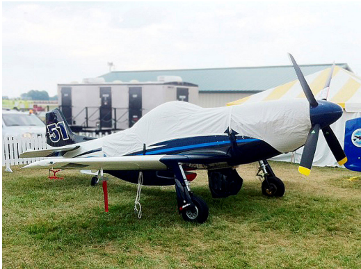
Thunder Mustang Canopy & Engine Cover