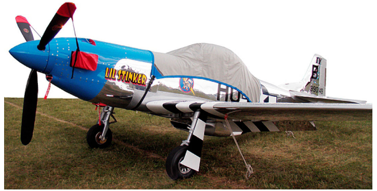
Stewart Mustang Canopy Cover, Prop Tie Downs & Intake Plugs Stewart Mustang Canopy Cover, Prop Tie Downs & Intake Plugs