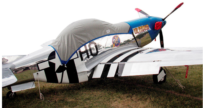
Stewart Mustang Canopy Cover, Prop Tie Downs & Intake Plugs